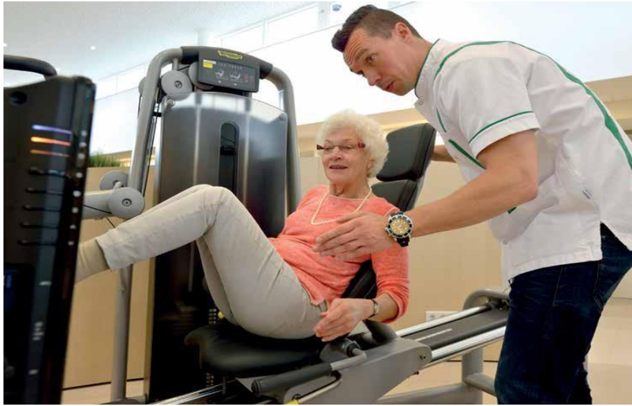
Figure 2: “Isolated” but still an exercise with more action than only in the upper leg extension muscles.

To push the weight away is not only a power in the extensors of the knee necessary but also the extensors in the hip and that asked for an action in the whole trunk (front and back) to give the muscles of the hip/leg an good anchor.[14]