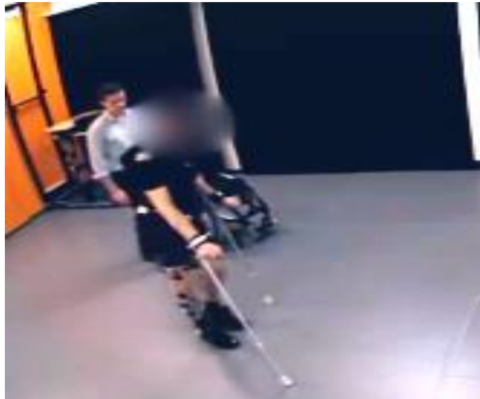
Figure 11: An person with an partial spinal cord paresis is walking with two elbow crutches. This support is necessary to control his balance and weight and make the variation in walking very poor. The power of the arms are now complete necessary to fill the gaps that are created through the spinal cord problem and now with the complete gravity on his body is walking pattern poor and balance is determinate through his crutches. Walking exercises on this way is an task specific resistance treatment for the arms and the upper trunk, or the legs have an benefit is an great question.