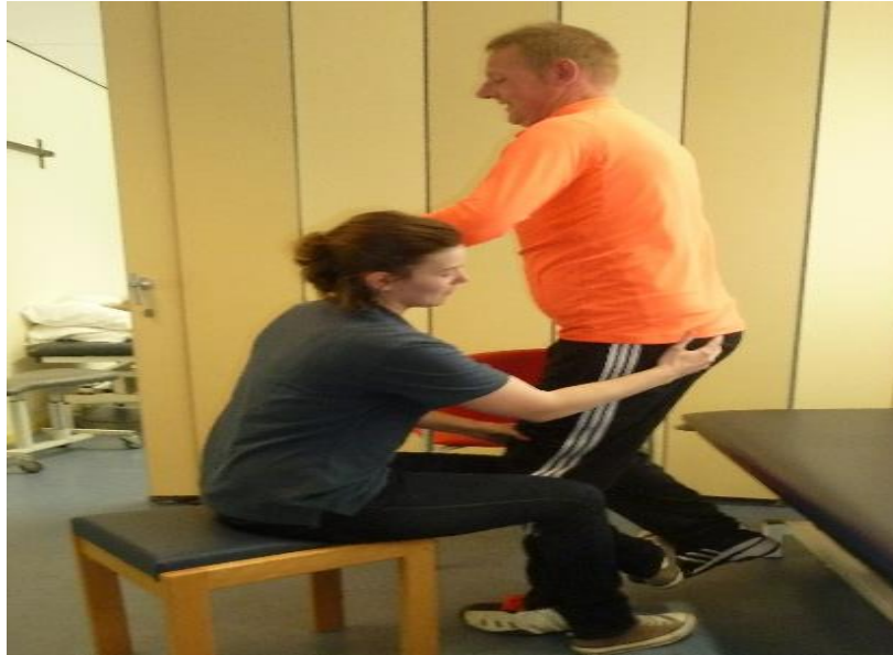
Figure 5: The assessment of 1 R.M. of hip extension of the left leg of this gentleman after an stroke about 1 year ago. His problem was that he wasn't capable to walk through and place his not-affected foot for his affected foot and that his speed was too slow. Of course, first the assessment or there were no mobility shortages in all joint, muscles and nerve tissues and that wasn't the case. There was in the affected leg an clear extension synergy but with dissociation but the tone in the muscle that are dominant is \pm MAS (Modified Asworth Scale 1-2 [27] en MI (Motricity Index leg) 48/99.[28,29] The assessment of the power of the extension contraction in the hip is done by an resistance against the feet of not-affected led and it is important to get the right direction.

First the coordination will increase after that the power and this must lead to an better walking pattern with more step length and speed.