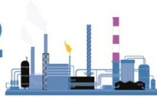
HUMAN IMPACT ON THE WORLD