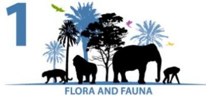
FLORA AND FAUNA