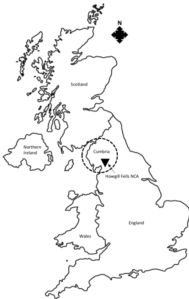
Fig. 1. The study area situated within the county of Cumbria (circled), in the Northwest of England (Mapsoftheworld 2019).

planting schemes and the plans of extending in the future. A large number of stakeholders have participated in previous and in extant tree planting schemes and/or are considering taking part in future planting schemes. Stakeholders included in this study woodland creation advisors, nongovernmental organizations (NGOs), interest groups, farm advisors, general public, landowners and farmers who were either considering planting, had already planted or did not wish to take part in any planting scheme. Together, this forms a good exemplary case-study, wherein the main stakeholders are included and provides an excellent opportunity for investigating their subjective opinions on the topic of woodland creation in the uplands of Cumbria.