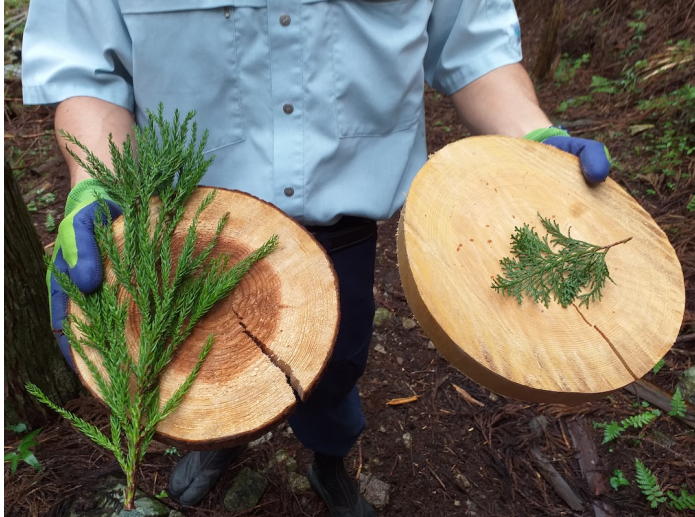
Dominant tree species in Japan. Left: Japanese red cedar ( Cryptomeria japonica ). Right: Japanese cypress ( Chamaecyparis obtusa ). Both specimens are around 200 years old.

human productive activity creating a range of ecological communities symbiotically (Takeuchi et al., 2016; Mansfield, 2011). The system is interconnected through the reliance on water management (quantity and quality); the forest areas act as collection zones to provide water for downslope activities. The system itself has evolved over hundreds of years, often through people negotiating land management between each other for benefit of the wider community. Recently, there has been renewed interest in satoyama by the Japanese government as a way to slow rural depopulation and enhance economic development ( Japanese Times , 08/07/19).