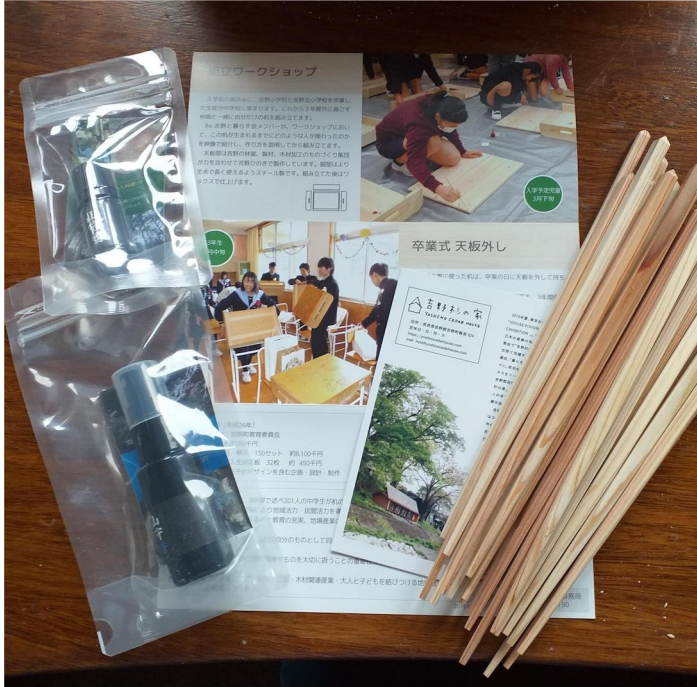
Timber products, Yoshino, Nara Prefecture.

yakatori (skewered meats) cooking and eel broiling. The charcoal cooks the food without the characteristic external burning of many less dense forms. It is also used for water purification, dehumidifiers in rooms and as a soil improver.