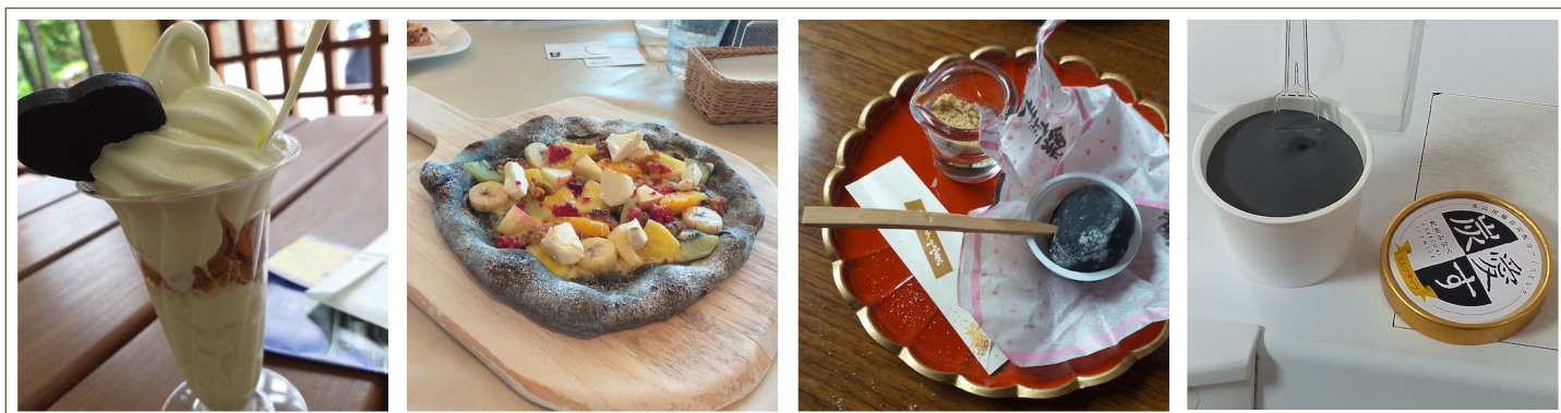
Using charcoal in foodstuffs, Minabe-Tanabe Area, Wakayama Prefecture.

In order to continue to compete effectively as costs increased on hill and upland farms, one of the first savings was the reduction in labour. Coupled with lack of relevant knowledge and skills, this situation has created inertia,