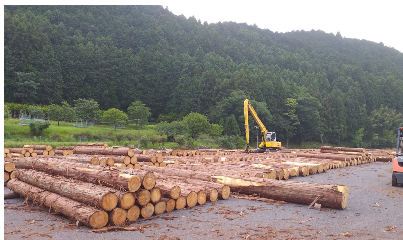
The Timber Market in Yoshino, Nara Prefecture.

At a national level a range of forestry legislation exists covering general management (Third Forest Act 1965), the multifunctional role of forests (Forest & Forestry Basic Act 2001) and governance structures (e.g. Forest Owners Cooperative Association Act, 1978 plus amendments). For example, the Third Forest Act 1965's main aim is "the sustainable growth of the forests and the improvement of forest productivity in order to contribute to the conservation of national land and the development of national economy" (FAO, 2010). Whilst this sounds progressive, the