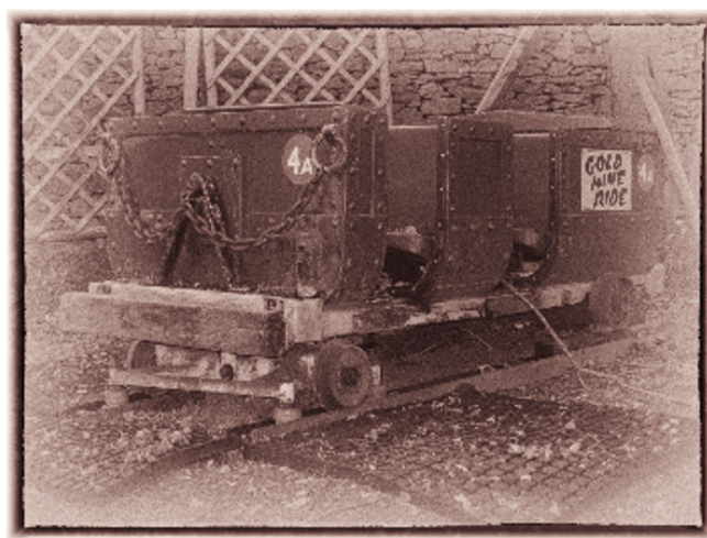
Figure 14. ‘Gold Mine Ride’