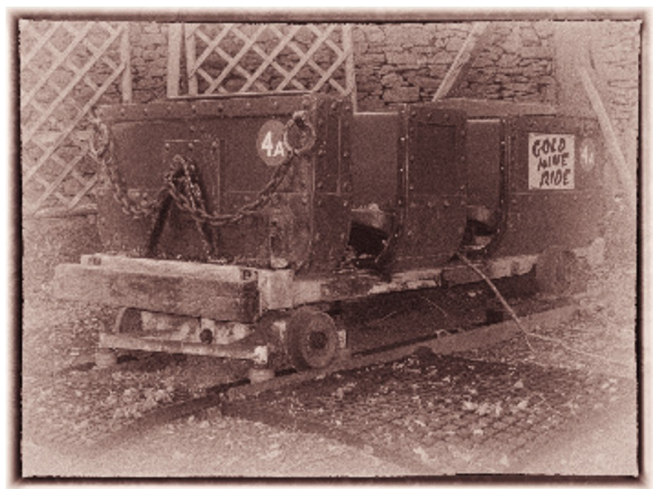
Figure 14. ‘Gold Mine Ride’