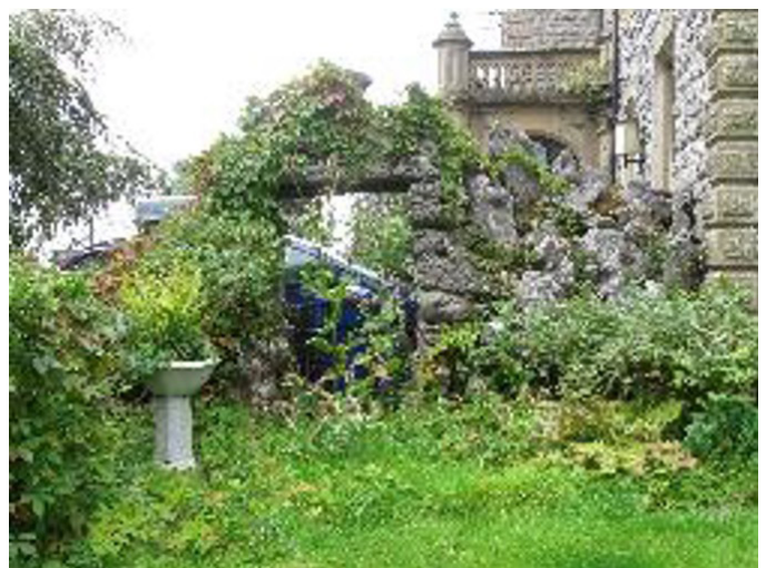
Figure 8.

George highlighted enhanced social capital as a highly