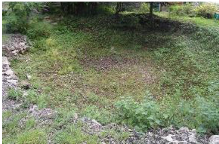
Figure 3 & 4. Dry stone walling and wildlife pond development