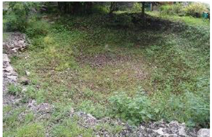
Figure 3 & 4. Dry stone walling and wildlife pond development