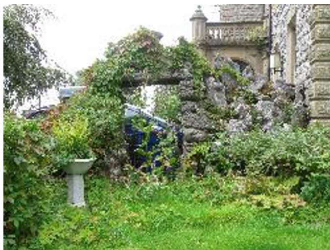
Figure 8.

George highlighted enhanced social capital as a highly