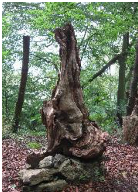
Figure 10. Tree stump

Therefore, in keeping with the overall ethnographic methodology, a more flexible interview approach rather than protocol was used which may be challenged as deviating from the method. TA typically places an emphasis upon ' reasoning ' and ' problem solving ' in an operational organisational context, for instance in nursing practice (Banning, 2008). Here, the process of reasoning has relevance in the sense that the volunteers were encouraged through TA to reflect upon and evaluate their current mental health status, consider how their wellbeing was being influenced by their engagement in the project, and explore how their own personal journey at the centre promotes resilience and problem solving of their personal situation. For example, Dan suggested a growth in self-esteem and self-worth hitherto lacking from his recent life: