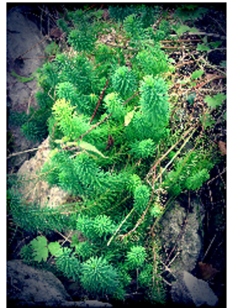
Figure 12. Belongs to the ocean?