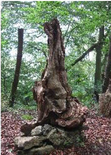
Figure 10. Tree stump

Therefore, in keeping with the overall ethnographic methodology, a more flexible interview approach rather than protocol was used which may be challenged as deviating from the method. TA typically places an emphasis upon ' reasoning ' and ' problem solving ' in an operational organisational context, for instance in nursing practice (Banning, 2008). Here, the process of reasoning has relevance in the sense that the volunteers were encouraged through TA to reflect upon and evaluate their current mental health status, consider how their wellbeing was being influenced by their engagement in the project, and explore how their own personal journey at the centre promotes resilience and problem solving of their personal situation. For example, Dan suggested a growth in self-esteem and self-worth hitherto lacking from his recent life: