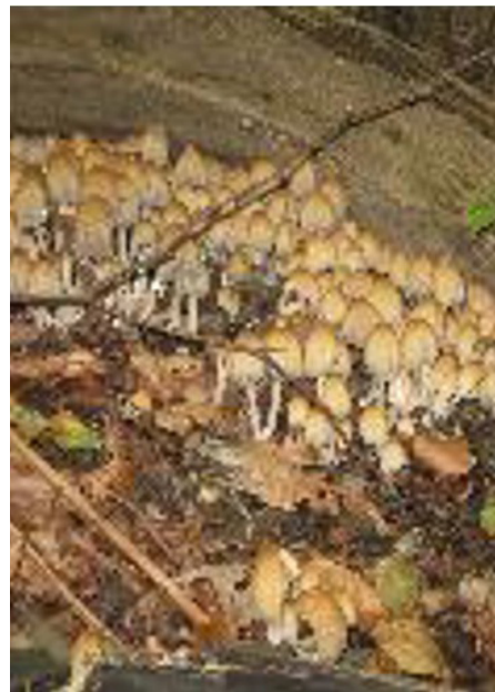
Figure 11. Mushrooms