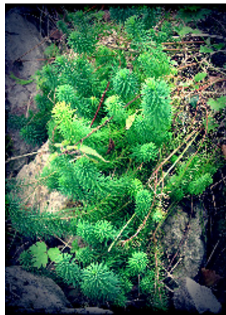
Figure 12. Belongs to the ocean?