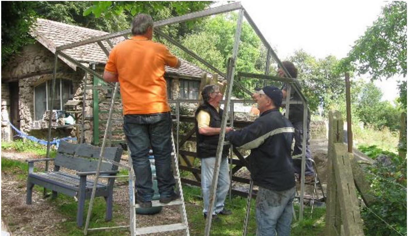
Figure 9. Constructing a greenhouse