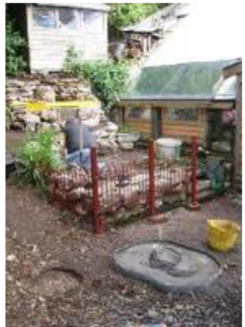
Figure 2. Construction of a small pond from recycled components