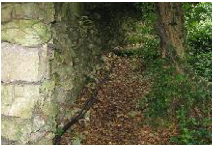
Figure 13. Woodland path

“This place is starting to make a bit of sense now. At first the quirkiness that is so apparent on first arriving, characterised by these follies dotted around like the old cart and fairground ride artefact, it just seemed to be totally random. And it is of course,