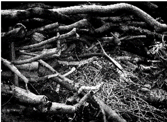
Figure 6.

“There’s a real sense of renewal here in respect of the activities and achievements the volunteers are engaged with. Renewal in a physical sense in respect