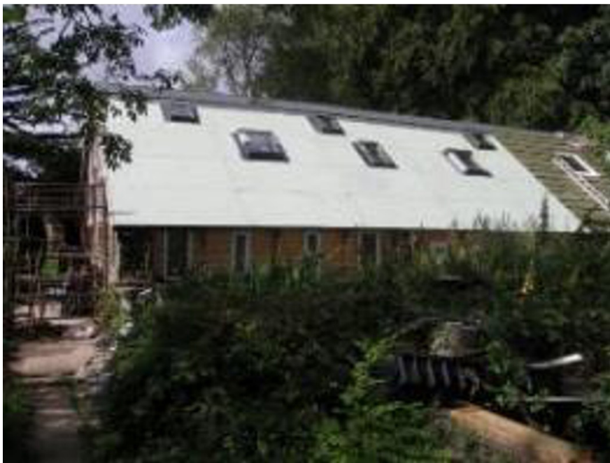
Figure 1. The main 'barn' for socialising over a tea break and lunch

The participants in the studied programme, addressed herein as volunteers, along with the site owners, engaged in autotelic activities on two occasions per week for at least four hours per visit. Volunteers had open access so there was no time limit to engage and disengage in the programme - the ones the researchers interacted with had mostly been with the project for between a year and three years. The researchers themselves adopted an 'active participant' role (DeWalt & DeWalt, 2002; Silverman, 2016), working alongside the volunteers in practical activities over several weeks (see later description), and also socialising during coffee and lunch breaks, thereby placing a premium on the experiential nature of the research approach (Mason, 2003; Etherington, 2004). This also provided further insight into the social and situational dynamics of the setting. Options for occupational engagement included