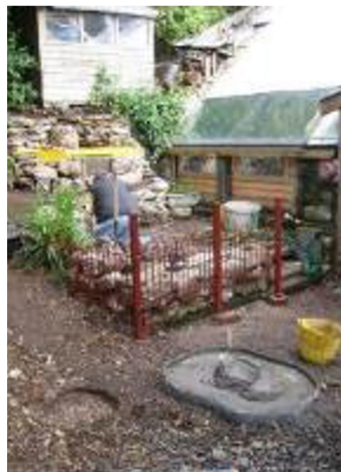
Figure 2. Construction of a small pond from recycled components