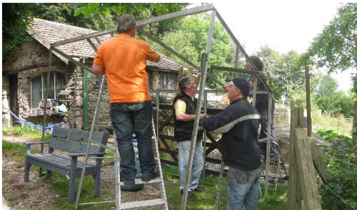
Figure 9. Constructing a greenhouse