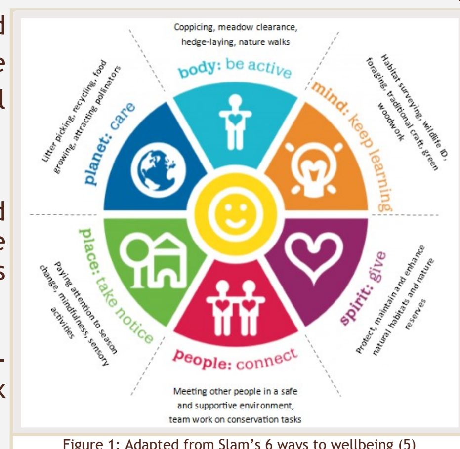
Figure 1: Adapted from SLam's 6 ways to wellbeing (5)

The trust describes that their weekly four-hour activities are based around SLam's six ways to wellbeing (Figure 1).