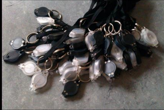
Keyring torches given to the audience at It matters to no one where we are (Sept 2014) and later at In the Presence of Darkness (Sept 2015)

Apart from the work itself and the way both film and sound were curated, which I don't have time to go into now, there was one other important addition to the work. On entering the space viewers had the option of taking a small keyring torch to aid them in their exploration of the exhibition.