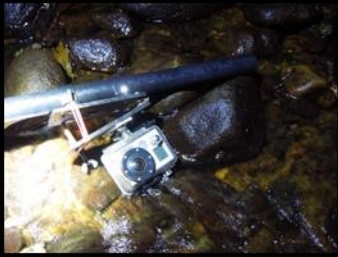
GoPro camera and custom made boom arm, River Gelt, August 2014