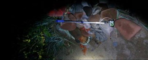
GoPro camera and foldable grabber arm, Beckfoot, July 2015