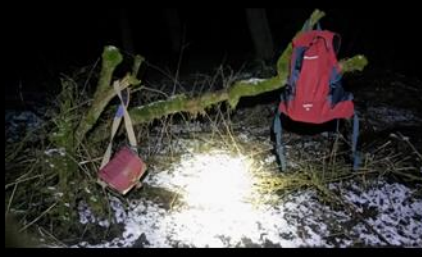
Camera bag and rucksack, Tindale Tarn, February 2015