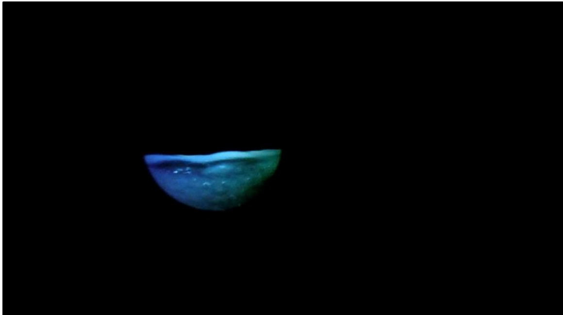
(Stills of documentary video of Warwick Mill exhibition)