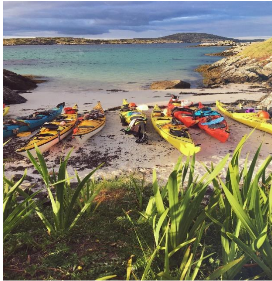
Figure 2: Sea kayaking expedition. Example of photograph posted on social media.

Students or the researcher also gave written summary of their answers during the photo elicitation interviews in their native language to facilitate naturalistic answers. Where notes were made by the researcher, the respondent gave their agreement that these were an accurate representation of the conversation, post interview. The responses in Spanish were later translated to English.