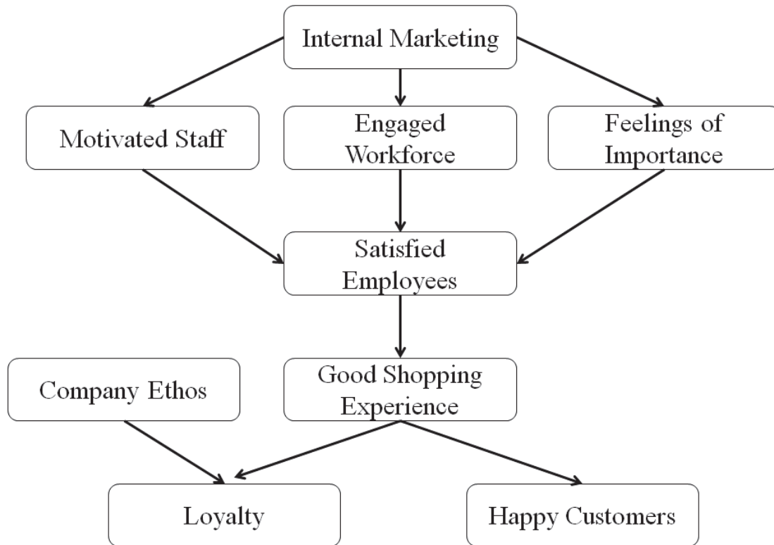
Figure 2 Categorised Themes