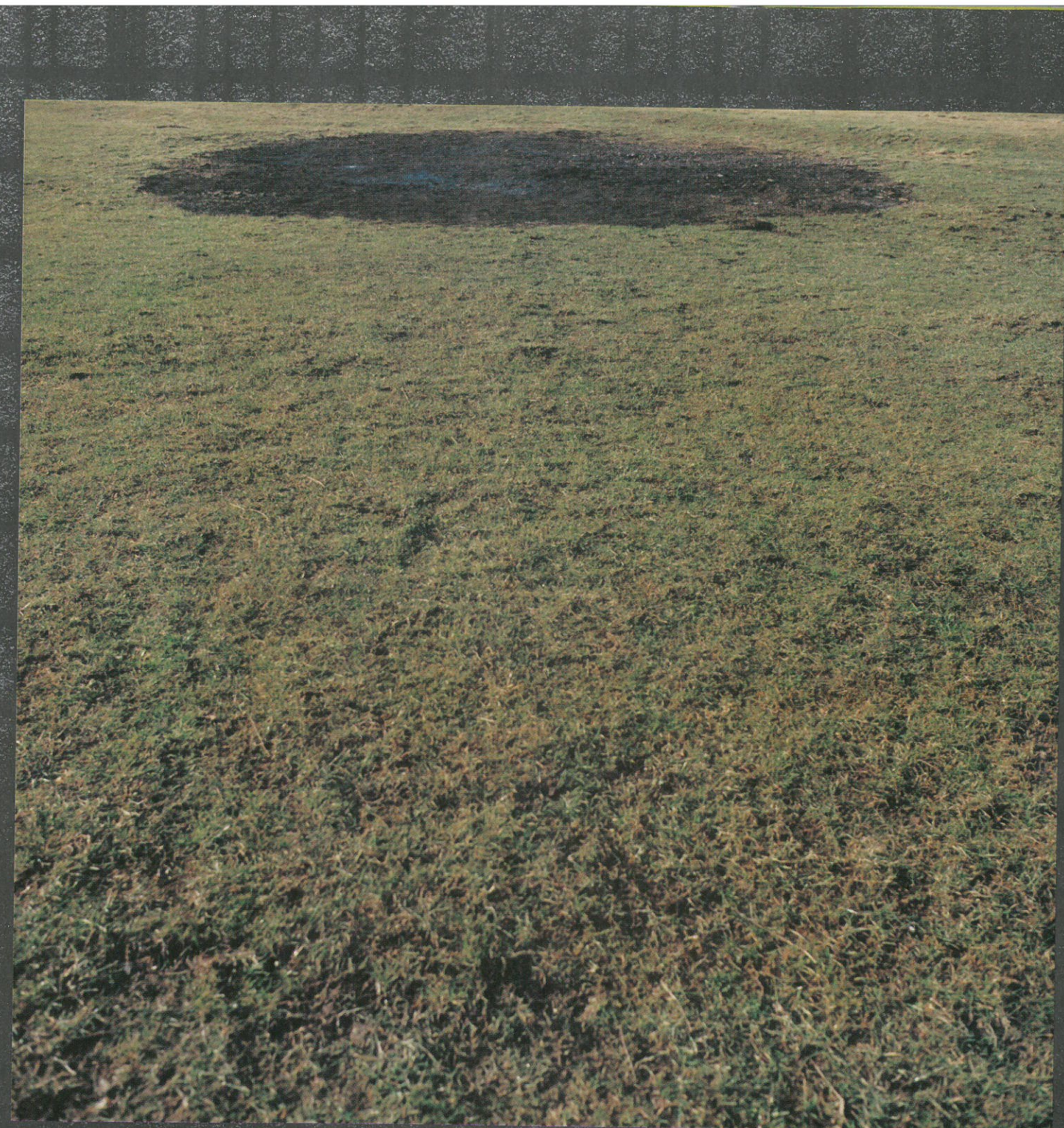
CECIL DAY LEWIS, "WHERE ARE THE WAR POETS?" 1943

It is the logic of our times, No subject for immortal verse – That we who lived by honest dreams Defend the Bad against the Worse.