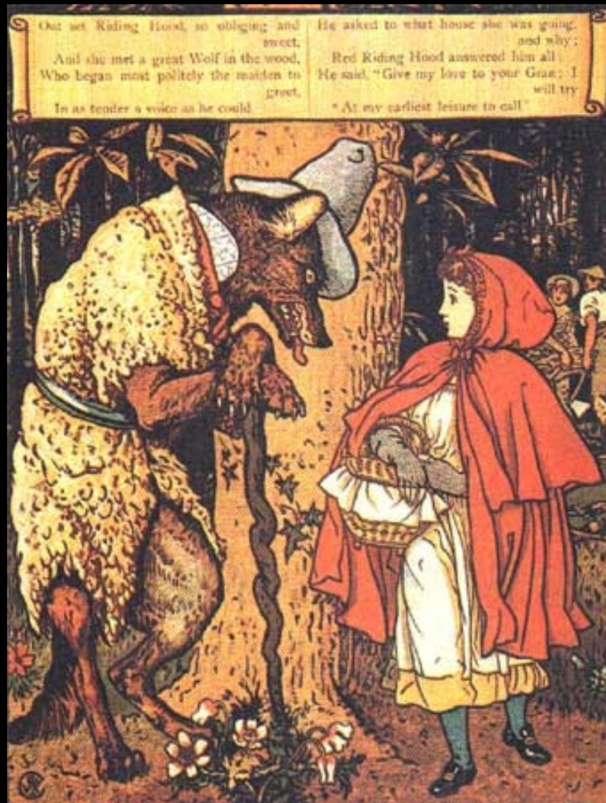
Walter Crane, Little Red Riding Hood 1875