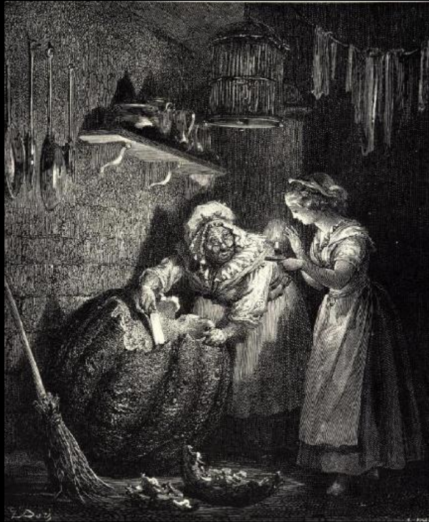
Gustave Dore Illustration for Cinderella 1867