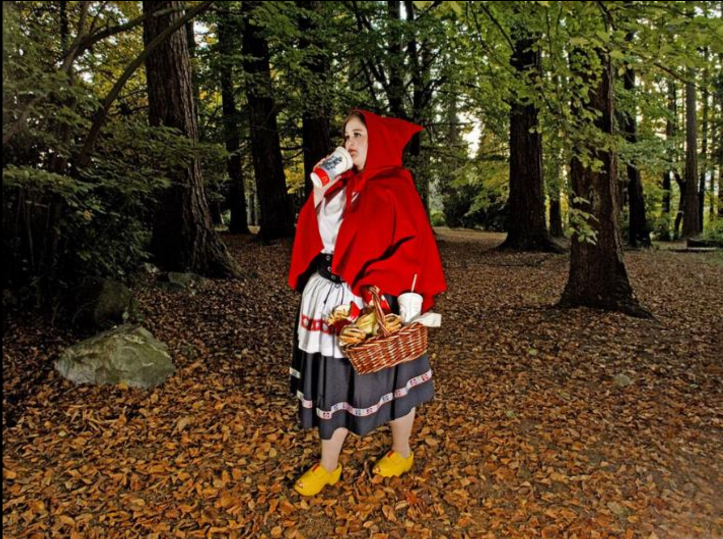
Dina Goldstein Red , from the Fallen Princesses series 2007