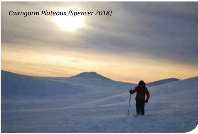
Cairngorm Plateaux

be involved in the 'banter'. This perception might also apply to a six-year-old in a well-bounded mature woodland being encouraged by a Forest School practitioner to "Go and Explore" as well as, more traditionally, a group of Duke of Edinburgh students making route decisions during their final expedition. In each case there may be a risk management framework woven around them which seeks to minimise risk of harm and maximise the benefits. If each participant feels they have autonomy and are engaged in an adventure then so be it, if on the other hand the level of oversight is perceived as too restrictive the sense of autonomy may be lost, and with it some of the benefits.