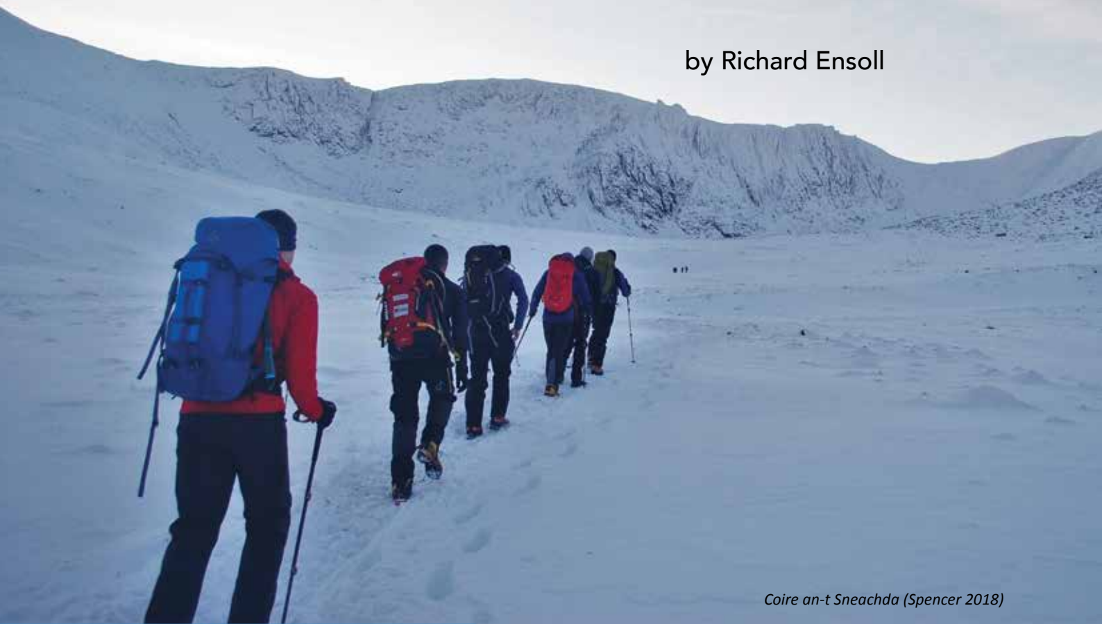
Coire an-t Sneachda (Spencer 2018)