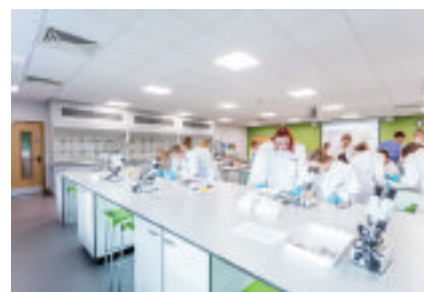
● Students at the University of Cumbria STEM labs in Carlisle, which opened in 2016 with funding from Cumbria LEP (Cumbria Growth Deal)

Attributing this trend to different causes is complex not least because it is affected by patterns of migration by skill level to and from Cumbria. It seems reasonable to presume, however, that recent investment in the skills system (universities, colleges, private skills providers) as well as the recruitment