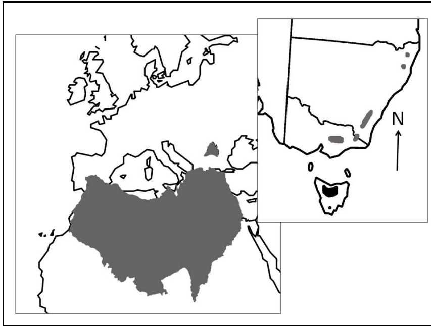
Figure 1 Main figure . Comparison of latitude and area of Europe and Australia (adapted from Turnbull and Eldridge 1983). Insert on the top right, and showing the natural distribution of Eucalyptus gunnii (black) and Eucalyptus nitens (grey) in southern Australia are given in black and grey, respectively (Brooker and Kleinig 1990).