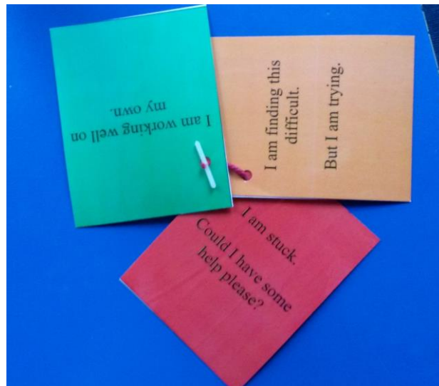
Figure 3. Traffic light assessment tool.

Furthermore, children were beginning to show increased signs of resilience . This was revealed through children articulating their experiences with regards to overcoming barriers within the process of learning. This suggests that they monitored their learning . They then responded to their analysis by backtracking to a point where they, 'felt like they were on the right tracks.' I started to show consistency with probing and responding to the children in light of the learning process. This may indicate that, through reflection, I have built upon the children's responses and the positivity of certain behaviours and attitudes. An example of this was when I emphasised the positivity of Megan's behaviour, through sharing her strategy with the class. Megan, without prompting acted out behaviour which arguably was influenced by the ETF and therefore my influence. This may show a realisation in Megan that she can rely on what she knows to help her. She may be showing initial signs of resourcefulness . I began to find it useful to explicitly share with the children my expectations and the behaviour I expected.