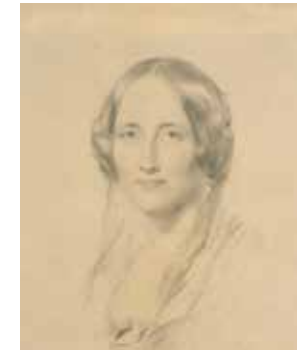
Elizabeth Gaskell (1810-1865)

was animated only by some horsemen riding remotely in groups towards Lancaster, along the winding edge of the water, and by a mussel-fisher in his cart trying to ford the channel we were approaching.