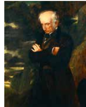
William Wordsworth (1770-1850)

We took the early part of the tide, and entered these vast and desolate plains before the sea had entirely left them, or the morning mists were sufficiently dissipated to allow a view of distant objects; but the grand sweep of the coast could be faintly traced, on the left, and a vast waste of sand stretching far below it, with mingled streaks of gray water, that heightened its dreary aspect. The tide was ebbing fast from our wheels, and its low murmur was interrupted, first, only by the shrill small cry of sea-gulls, unseen, whose hovering flight could be traced by the sound, near an island that began to dawn through the mist; and then, by the hoarser croaking of sea-geese, which took a wider range, for their shifting voices were heard from various quarters of the surrounding coast. The body of the sea, on the right, was still involved, and the distant mountains on our left, that crown the bay, were also viewless; but it was sublimely interesting to watch the heavy vapours beginning to move, then rolling in lengthening volumes over the scene, and, as they gradually dissipated, discovering through their veil the various objects they had concealed—fishermen with carts and nets stealing along the margin of the tide, little boats putting off from the shore, and, the view still enlarging as the vapours expanded, the main sea itself softening into the horizon, with here and there a dim sail moving in the hazy distance. The wide desolation of the sands, on the left,