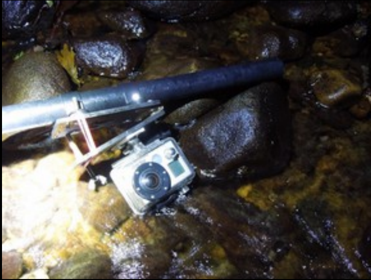
GoPro camera and custom made boom arm, River Gelt, August 2014