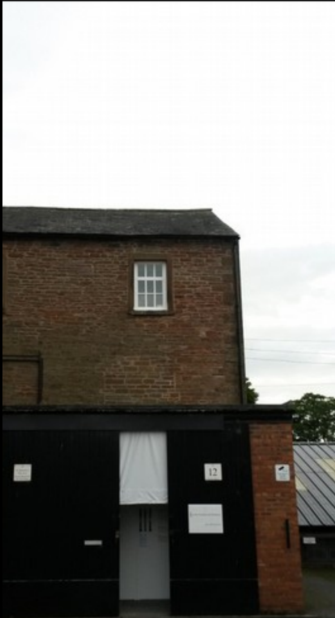
The alternative space: Unit 12, Warwick Mill