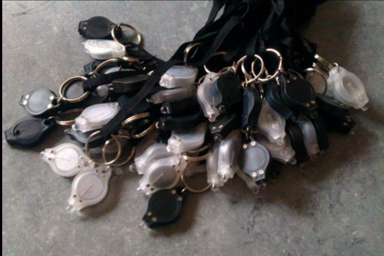
Keyring torches given to the audience at It matters to no one where we are (Sept 2014) and later at In the Presence of Darkness (Sept 2015)