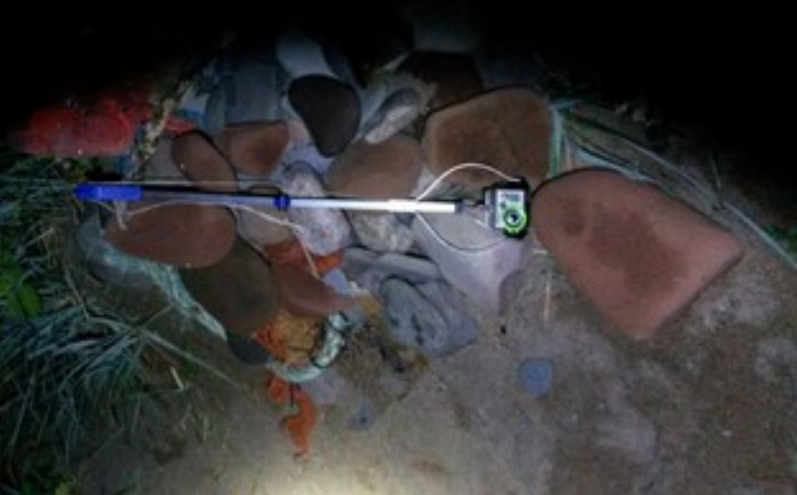
GoPro camera and foldable grabber arm, Beckfoot, July 2015