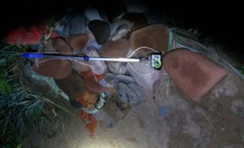
GoPro camera and foldable grabber arm, Beckfoot, July 2015