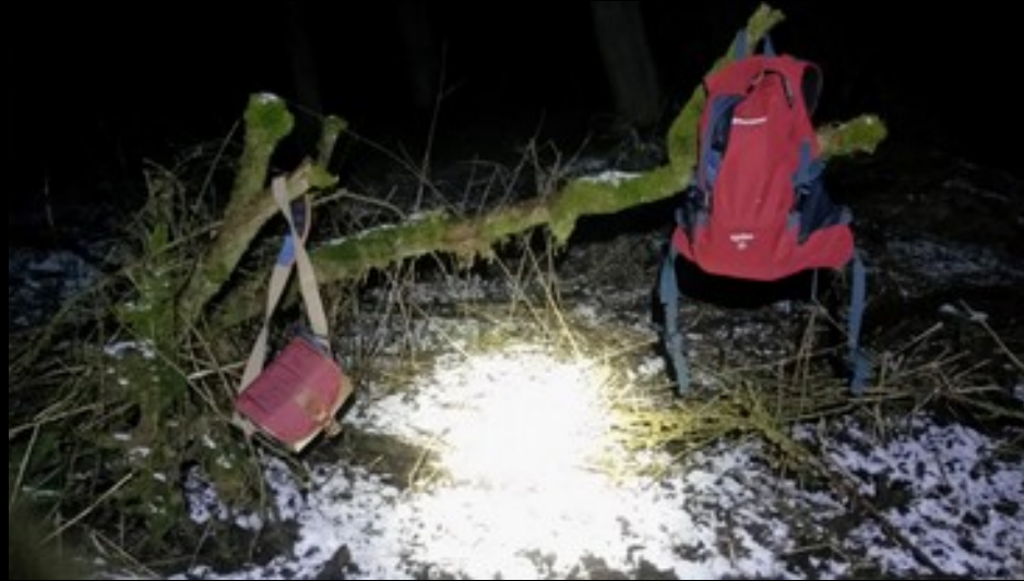
Camera bag and rucksack, Tindale Tarn, February 2015