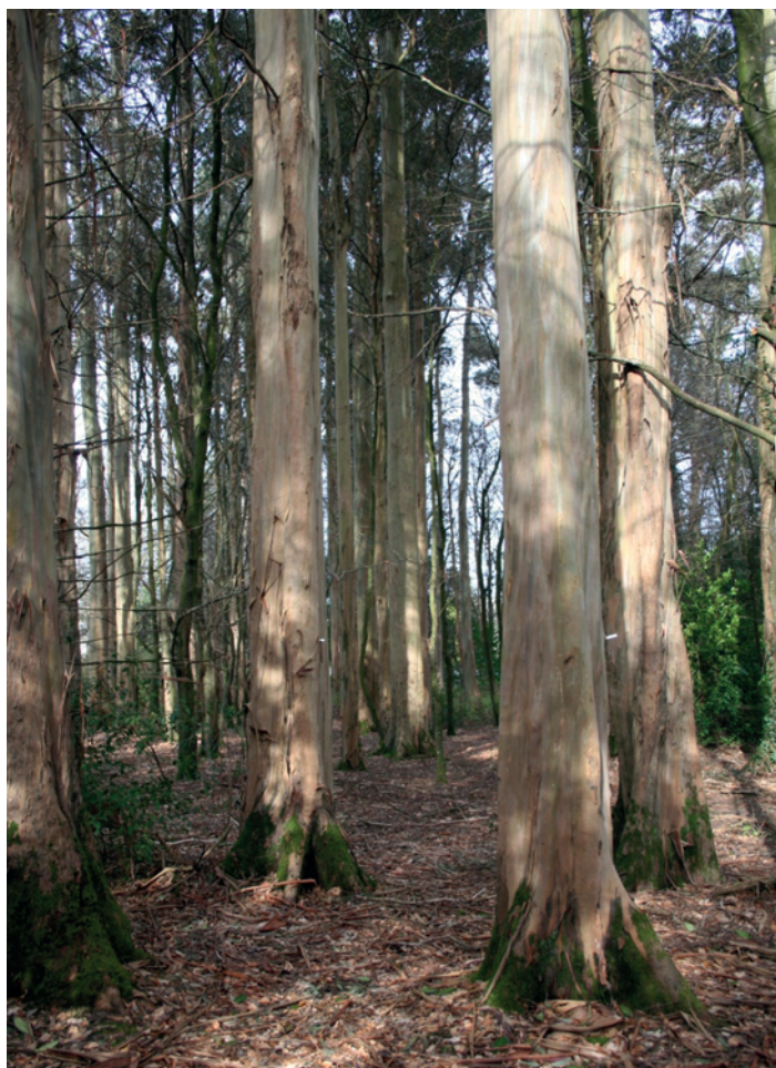
Figure 5. Eucalyptus johnstonii of unknown age at Avondale, Co. Wicklow, Ireland.

Both the yellow gums together with varnished gum ( Eucalyptus vernicosa Hook.) are endemic to Tasmania (Figure 1b) and form an altitudinal cline, with E. johnstonii found at lowest altitudes and E. vernicosa at highest. The literature, and records of plantings in Britain, confuse the identity of trees of this group, though the modern taxonomic distinctions between them are clear (Nicolle, 2006). E. johnstonii is a large forest tree of good form having very attractive smooth bark (Figure 5). It was formerly of minor importance in Tasmania for timber of good quality (Boland et.