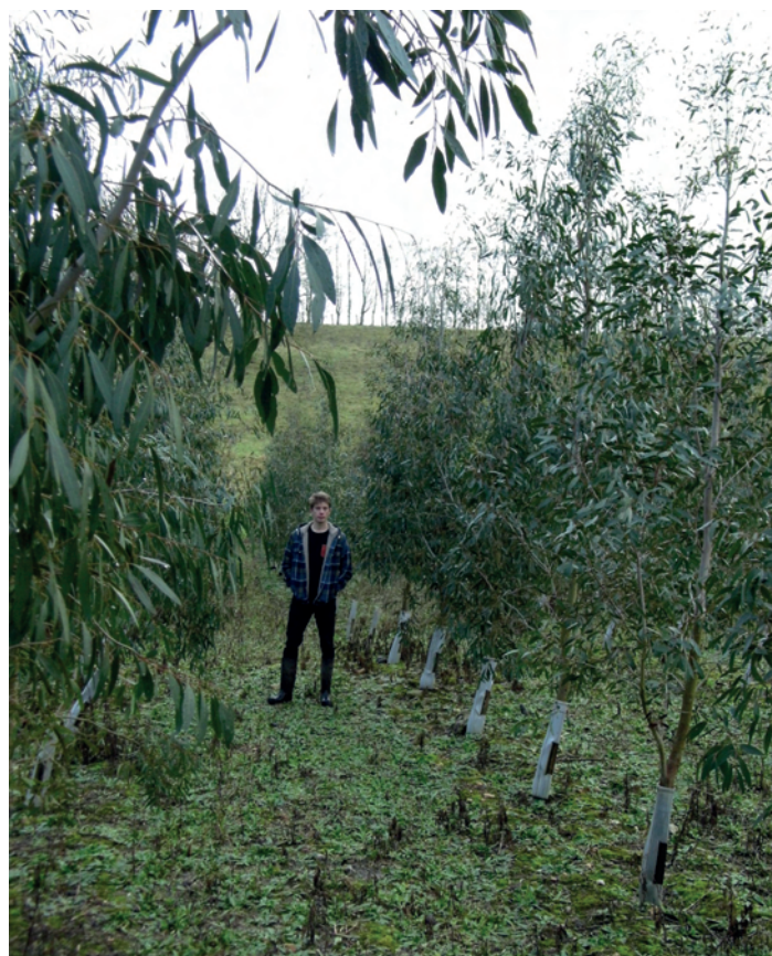
Figure 7. Eucalyptus rodwayi age 4 years, on a landfill site in north Kent. The soil is a thin clay cap, and the site is waterlogged every winter. Weed control has involved both spraying and mowing.