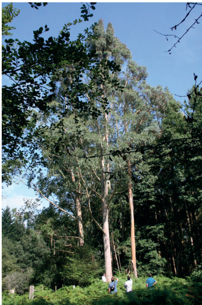
Figure 3. Eucalyptus glaucescens age 32 years in Forestry Commission trial NF38 in the New Forest, Hampshire.

Guthega, NSW origin exhibiting best survival across trials (Evans, 1986). This is consistent with informal observations elsewhere.