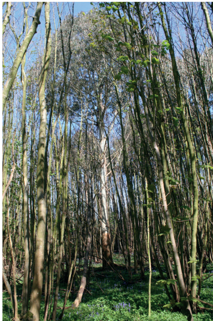
Figure 4. Coppice with standards? Eucalyptus nitens and mixed hardwood coppice both age 23 years in Cromers Wood, north Kent in 2012.

The canopy formed by the juvenile crown of E. nitens is impressively large and dense under good establishment