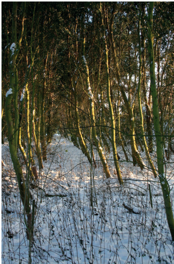
Figure 2. Eucalyptus gunnii ssp. divaricata age 8 years in a demonstration planting in north Kent. The poor form is typical of this subspecies when grown from seed.