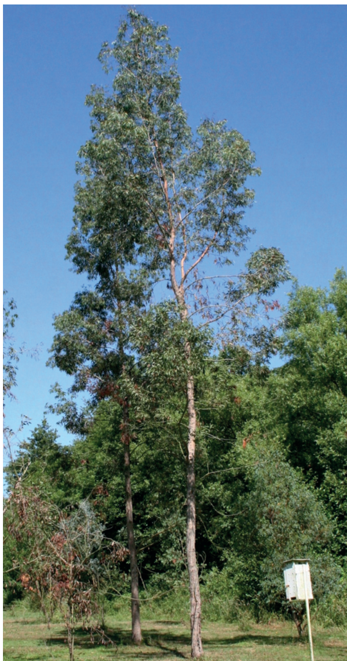
Figure 6. Eucalyptus rodwayi age 7 years growing on river gravel in the Darent Valley, Lullingstone Castle arboretum, Kent.

The species is less cold tolerant than the hardiest eucalypts. Young trees are usually killed to the ground by temperatures of -15^{\circ}\text{C} , though they have subsequently coppiced vigorously. As with other species, older trees are more cold-tolerant. The trees tend to be single-stemmed, but with poor stem form when young. Seed is available in commercial quantities from New Zealand, although the origin is not known, and its genetic base may well be limited. There may be value in comparing a range of provenances in Britain, to see if sources having better form, vigour and cold-tolerance can be identified. The closely-related mainland species, black gum ( Eucalyptus aggregata H. Deane & Maiden) is reputedly more cold-tolerant and deserves