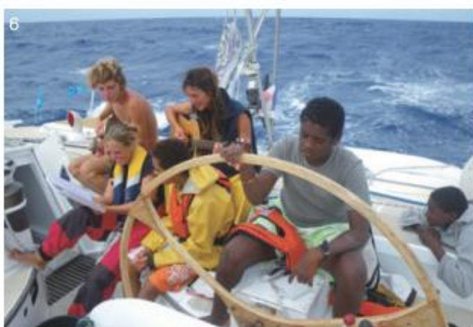
During the Atlantic crossing, the youngsters get the measure of the boat, and everyone does his or her share of the work.