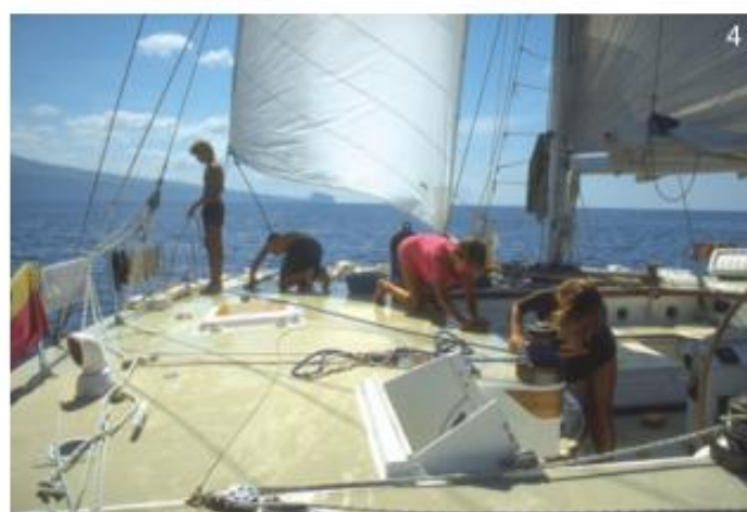
The Azores appear on the horizon after a nice passage, and the teenagers scrub the deck, so their boat will be the most beautiful in the harbour...