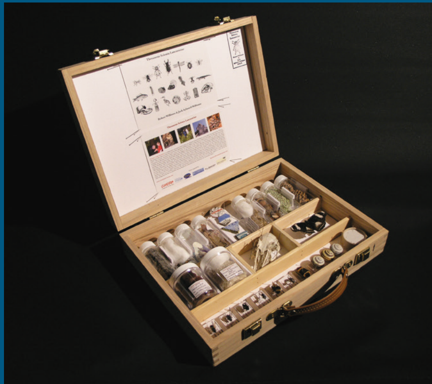
Solvik Taxonomia/ Quid Pro Quo (Box 1) 2005