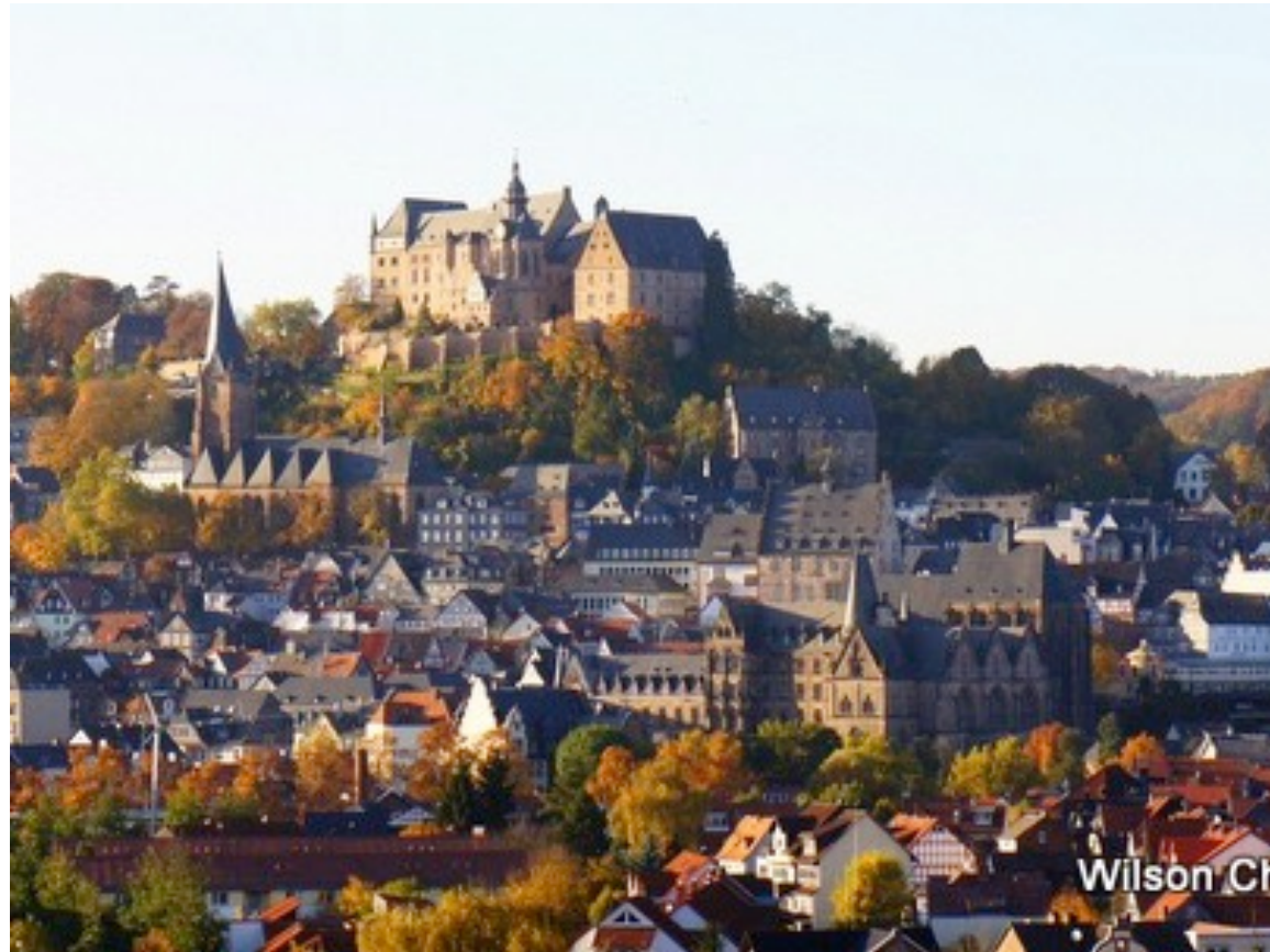
University of Marburg, Germany