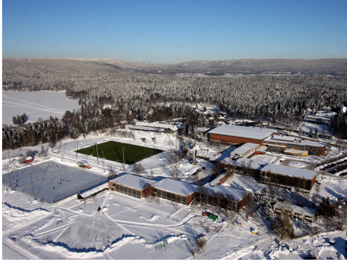
Norwegian School of Sport Science, Oslo, Norway