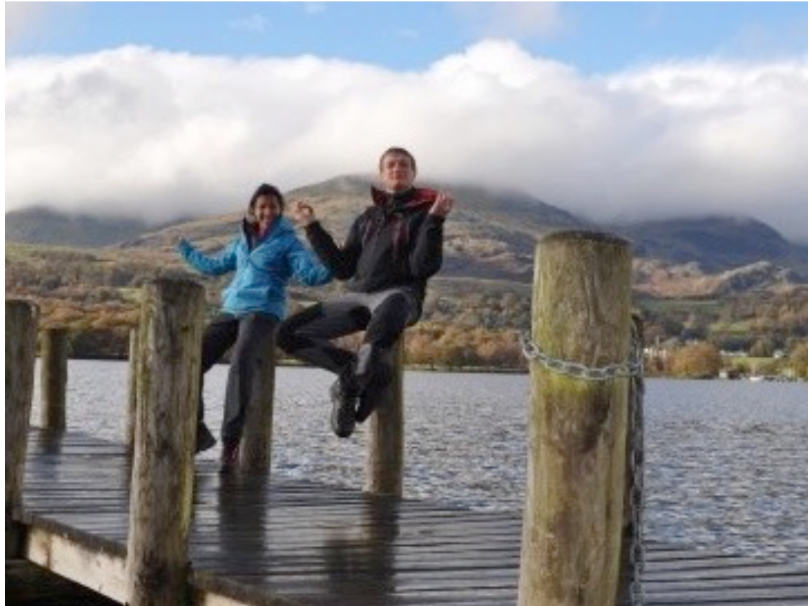
Ambleside campus, University of Cumbria, UK