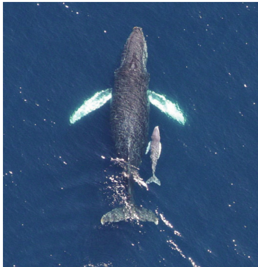
Figure 3. A mother humpback whale and newborn calf photographed off Baja California, Mexico, Oct 2009. When necessary, the mother will use her massive pectoral flippers to defend her small calf from attacking predators, especially killer whales.

Various other functions have been suggested for the humpback's over-sized flippers, including prey herding, visual and acoustic signaling, temperature regulation, “coital clasping” during mating, and increased swimming proficiency and maneuverability (Edel and Winn 1978, Fish and Battle 1995, Woodward et al. 2006). These massive flippers can be especially important during the breeding season, when adult