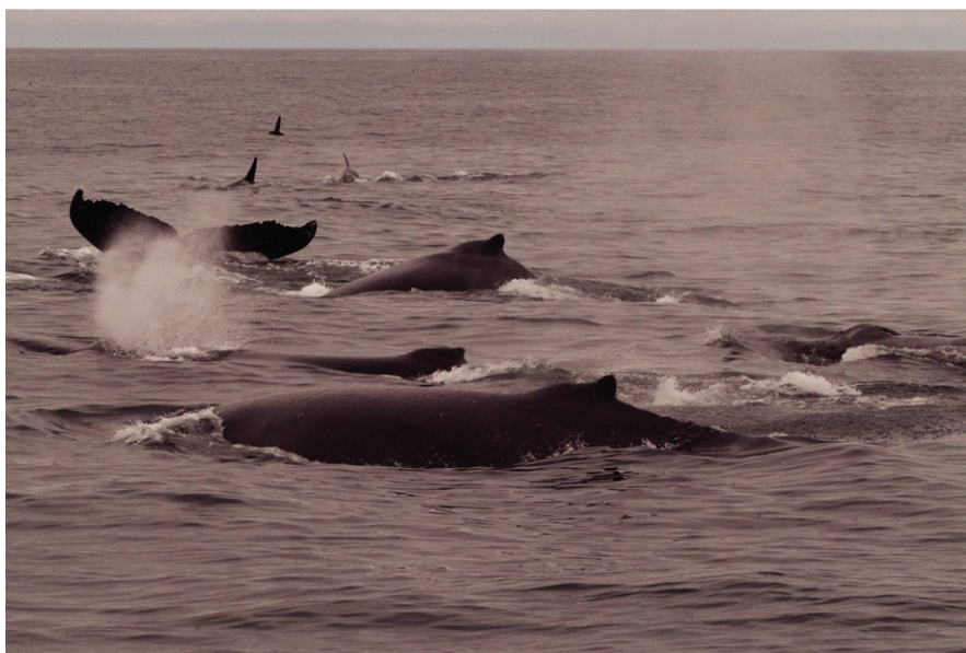
Figure 4. In the Aleutian Islands, Alaska, 17 Bigg's killer whales (in the background) attacked a large humpback calf accompanied by its mother and an escort in July 2003; three other adult humpbacks joined in and helped drive off the killer whales. (This record arrived too late to be included in Appendix S2).

MEKW's (#38). The latter and Acevedo-Gutiérrez (2009) are, to our knowledge, the only reports of rosette-formation by humpback whales.