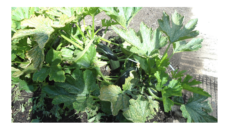
Figure 3. Vegetable patch