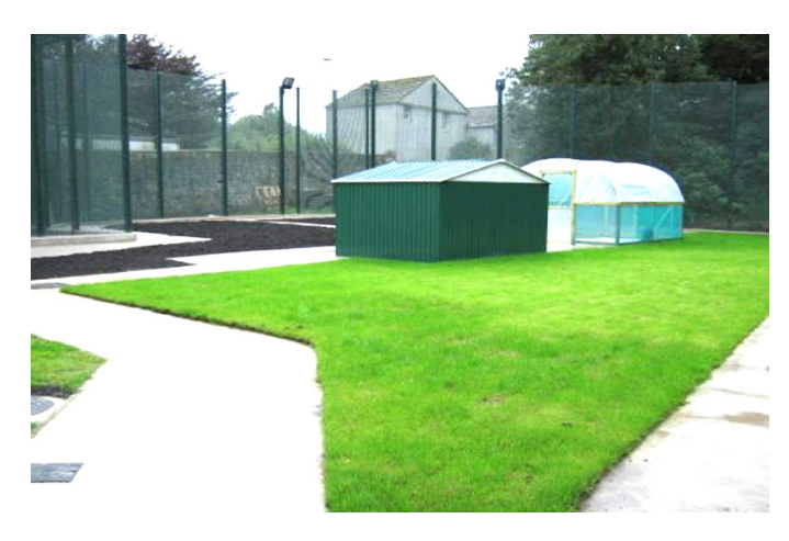
Figure 1. The medium secure unit garden involved in the study with shed & greenhouse