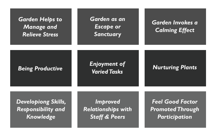
Figure 5. Sub-themes

The focus group discussions were designed to identify not only service users' views as to the personal benefits derived from their participation in the HT program, but also the mechanisms through which these came about. As noted above, analysis revealed nine sub-themes, as illustrated in Figure 5.