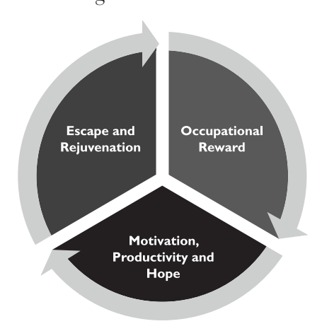
Figure 6. Emergent core themes

The overlapping character of these sub-themes within participants' own accounts rendered salient three core themes, shown in Figure 6.