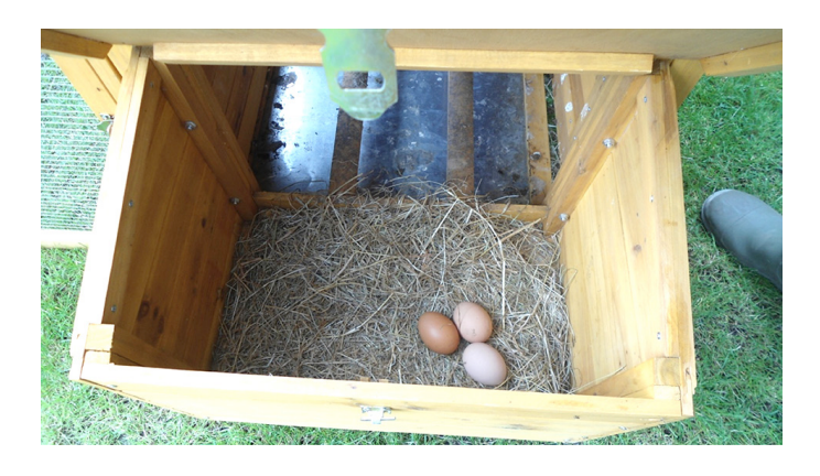
Figure 2. The chicken coup