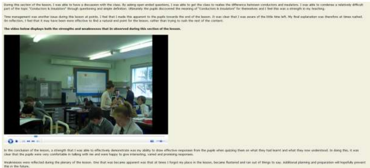
Fig. 1. Screenshot of a page from a typical student's WIMBA.