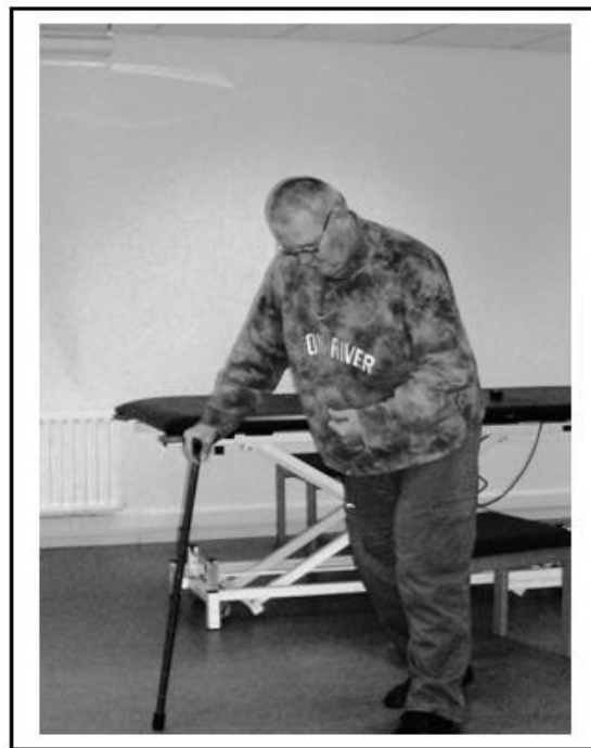
Photo 5: Look when he walks with a normal cane and compare it with walking behind a chair or special rollator frame. The placing of the cane is far in front of him and far lateral also. Still, he places a great amount of support to activated the back diagonal from the not-affected arm/upper trunk to the affected leg. Even the index finger pointing to floor must help to activated the extension power of his affected leg. This moment was often very important! when he “feel” that his affected leg give an answer, he walks further but when that feeling wasn't there than he freezes.

Looking at photo 2 and 3 and comparing this two with the other two, than is the amount of support on the backside of the chair gigantic. And his upper trunk moves almost over this backside. That means that the amount of pressure on his not-affected arm is great and that the back diagonal starts here and goes to the affected leg. There is a contraction in the gluteal because between photo 2 and 3 there is no more flexion in his hip. Still is there a change that the adductor muscle created the extension because the diagonal is maybe not ended in the “heart” of the hip.