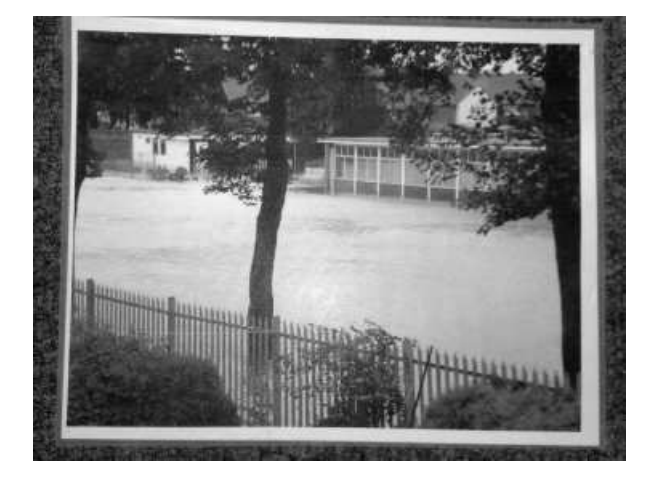
Figure 2 School under water (from Primary School notice board).

In trying to describe the first few days of the floods, respondents used terms such as 'surreal', 'crazy' and 'an absolute nightmare'. For example, FSE04 states that 'it seems unreal now. Even looking back you tend to forget how bad it actually was' (Figure 2 indicates the level of flooding at one of the study schools).