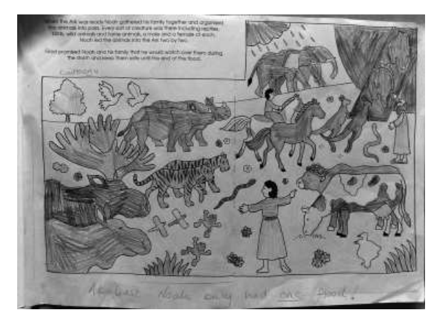
Figure 3 Using the flood in the curriculum (with wry comment from teacher).

incorporated into the curriculum in various subjects and particularly, PSHE, Art, English, Geography and Science.