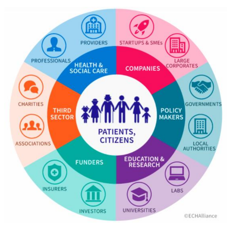
Figure 1. Example of a Health and Wellbeing Eco-system

The situation with regards to equity in health and healthcare is challenging and given the current climate, cannot be fixed by NHS services alone – a situation recognised by several respondents who called for greater collaboration with the VCFSE sector. Therefore, there is a need for health and wellbeing eco-systems in Cumbria such as that illustrated in Figure 1. Health and wellbeing eco-systems aim to combine actions at all levels and across sectors, for example, health services (front line, managerial, commissioning), local authorities, local business and VCFSE, together with the development of participation structures for community engagement.