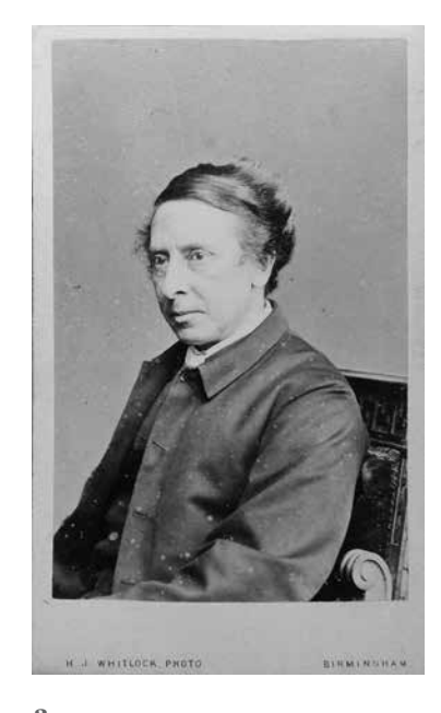
The Reverend Charles Voysey, c.1865