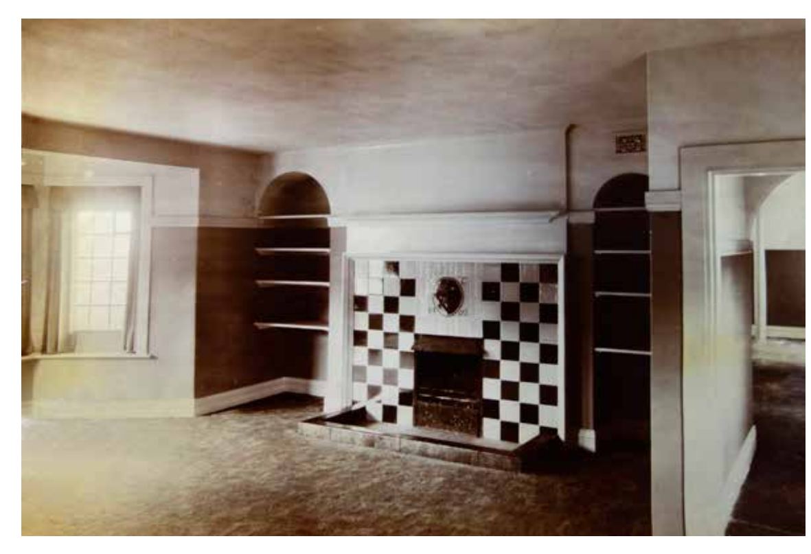
3 The Parlour photographed c. April 1904

The Orchard number 7 2018 Was there a fourth painted clock?