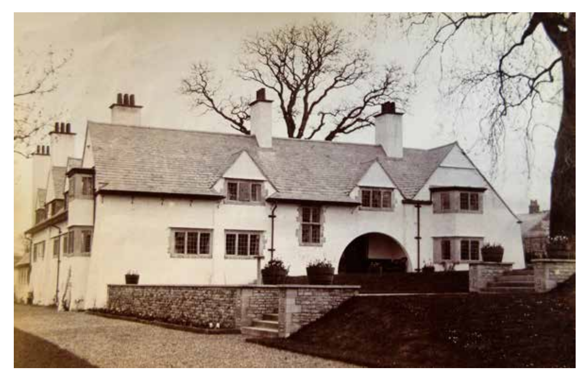
The Pastures, North Luffenham photographed c. April 1904

as to when they were taken. Close scrutiny reveals a handful of trees to be in early leaf whereas the majority are bare. This, together with the absence of fallen leaves, the fact that the garden has yet to be planted and daffodils appear to be flowering, would indicate they were taken in early to mid-spring, shortly after the house was completed – that is, approximately April 1904, a few weeks too late for them to be included in The Studio article.