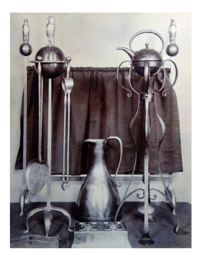
6 Metalwork, the majority manufactured by Thomas Elsley & Co 1903

You will arrange my rooms with their furniture so that each piece has the place most suited for its use, with light helping to make it more useful, so that we feel that no single bit of furniture is quarrelling with or harassing another, and everything shall have its useful purpose. Thus proportion and grace and the intention to serve a useful purpose will provide the very best elements of beauty, and ornaments will be little required.<sup>9</sup>