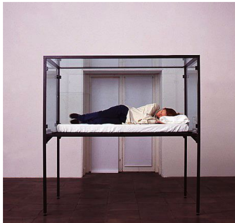
Figure 1 Cornelia Parker and Tilda Swinton, The Maybe 1995

Sleeping Beauty , despite the fact that it narrates the significant attributes of femininity as these have developed in white Euro-American culture, has not been widely adopted by artists or other visual media. The central character is not strong and little happens in the tale. Yet the visual language in the tale is powerful and provides a platform for performance artists to bring into question the notion of beauty as femininity. Cornelia Parker's (b.1956) collaboration with actress Tilda Swinton (b.1960), The Maybe (1995) (figure 1), evokes visual readings of Sleeping Beauty .