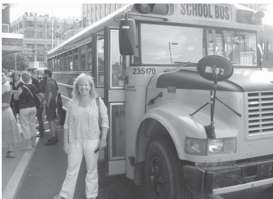
The author, on the way to the Institute Dinner