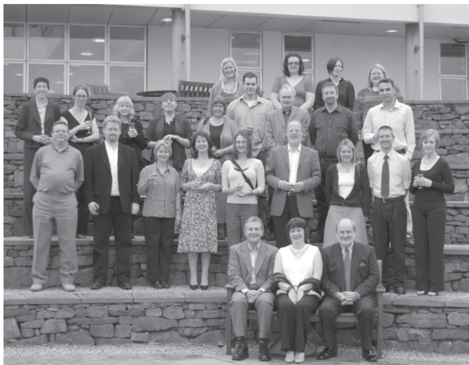
Education developers from Scotland enjoying a break at their Summer Conference at Sabhal Mor Ostaig College in Skye.

NB SEDA members automatically receive copies of Educational Developments .