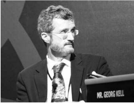
GEORG KELL: INCREDIBLE EFFORTS

have been the traditional leaders of CR and active in UNGC. However, the majority of UNGC members are from the rest of the world, and together could become the new leaders in a new phase of CR focused on systemic change in economic governance, that revitalises role of the UN in a more multi-polar world.