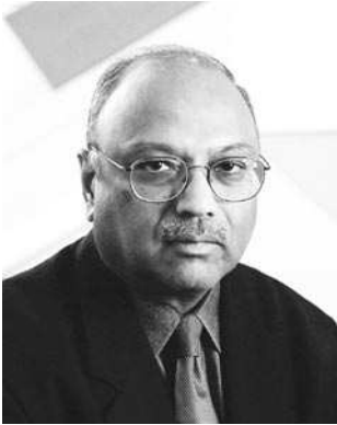
C.K. PRAHALAD: 1941–2010: PROGRESS STILL TO BE MADE AROUND HIS BoP LEGACY