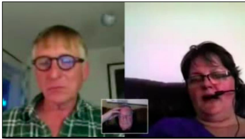
Video 3. Living Theory research support group (Whitehead, 2015)