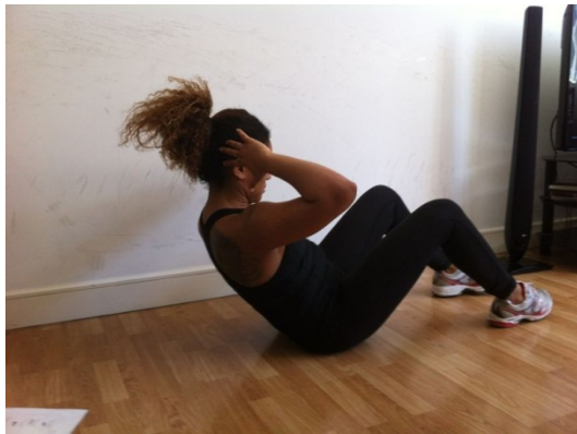
Abdominal Crunch Week 1, 2 = 3 x 20 reps