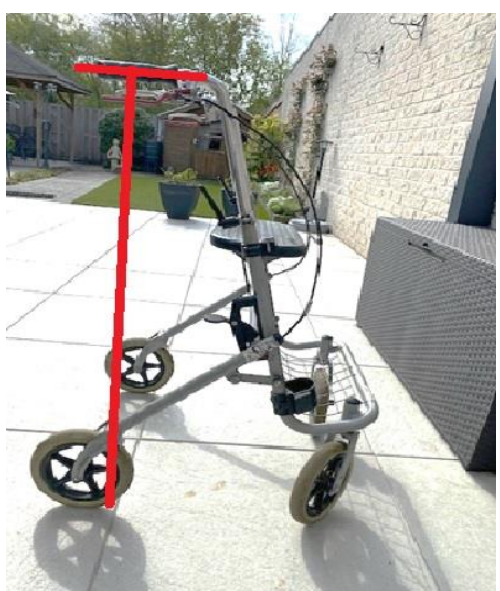
Photo 1: Wikepedia [11]: A walker (North American English) or walking frame (British English) is a device that gives support to maintain balance or stability while walking, most commonly due to age-related mobility disability, including frailty. Another common equivalent term for a walker is a Zimmer (frame), a genericized trademark from Zimmer Biomet, a major manufacturer of such devices and joint replacement parts. Walking frames have two front wheels, and there are also wheeled walkers available having three or four wheels, also known as rollators.

This pathological tone will decrease when people create an greater support area and have more control over their balance but this asked from all therapist that there is an good assessment why this extra aid is important and thus also knowledge which walking aid, but also the control, how this developed, is important so that people can hold their independency as long as possible.