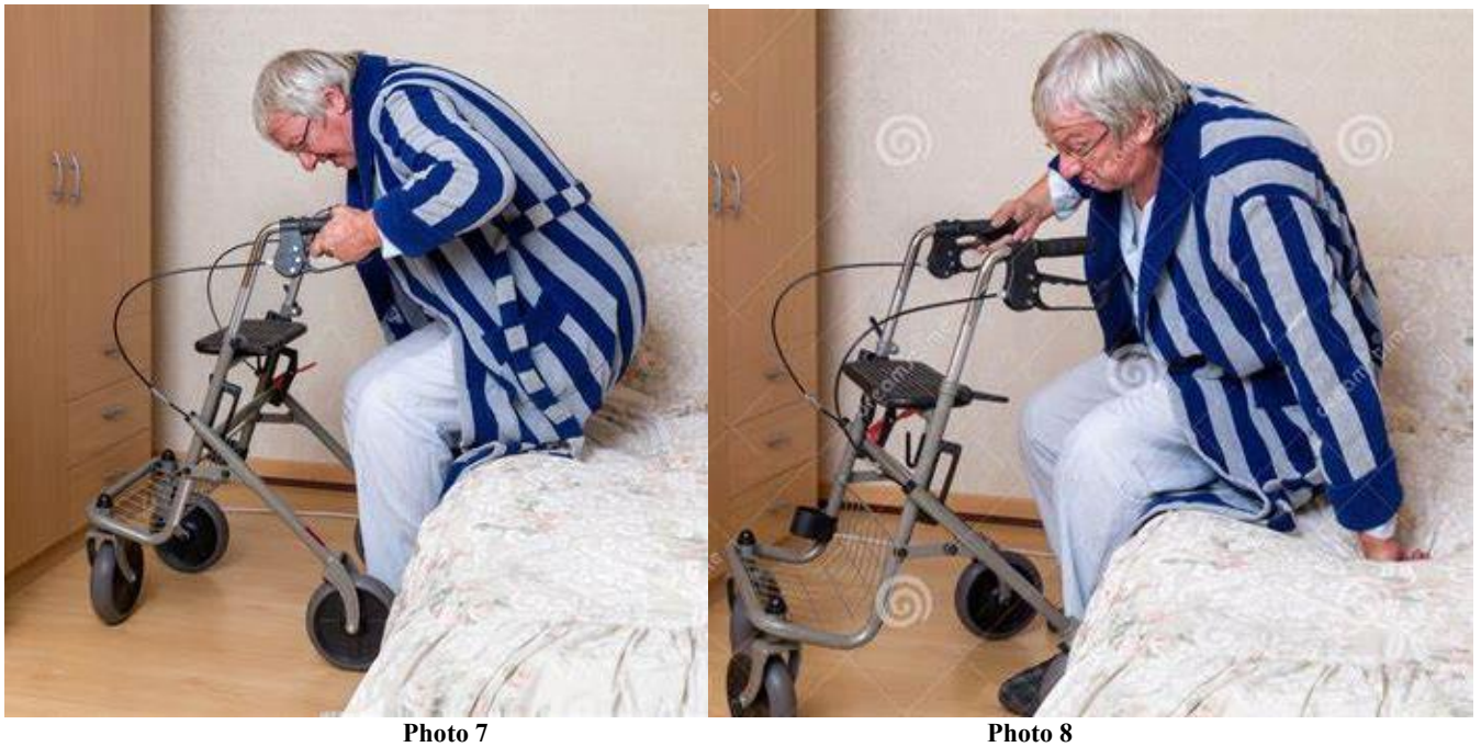
Photo 7 and 8: Regrettable still today have people the idea that the rollator frame can be useful for standing up, that is an utopia. When the power in the legs are too less to get to stand than will the rollator frame cannot contribute, because the handles are too high and inhibit an good trunk movement to the front. The solution what this gentlemen let us see ( photo 8) is an solution in which the burden on the legs and the technique of the trunk ( Vorlage) improve but the whole situation isn't good for an person that need an rollator to walk in his home.