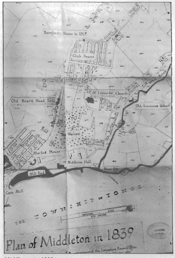
Middleton in 1839.