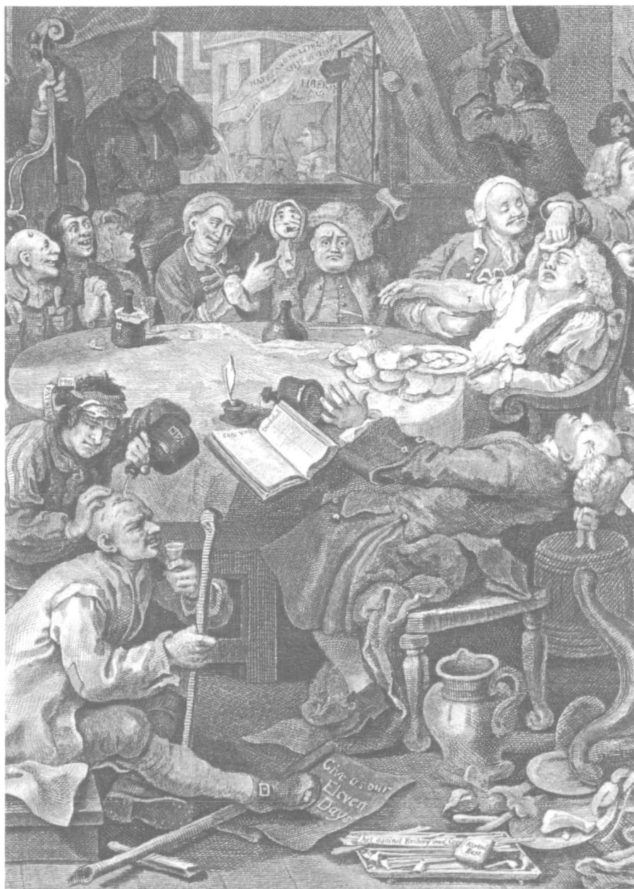
Hogarth, The Election , Plate 1: "An Election Entertainment" (February 1755), detail.