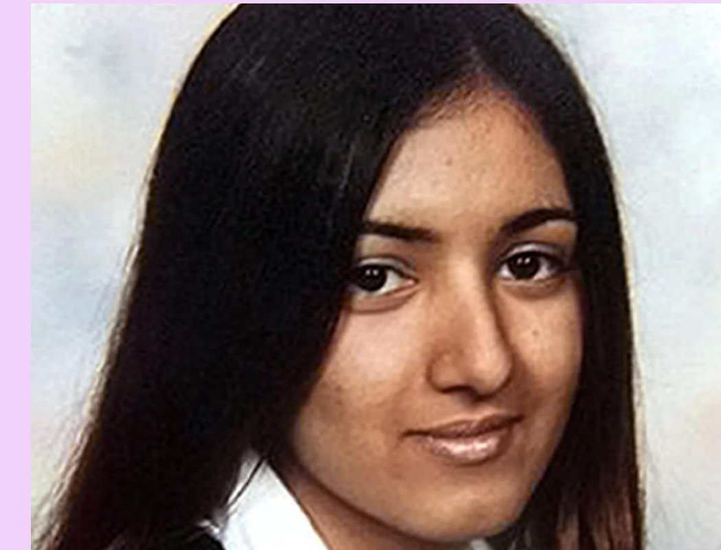
The Independent, 2016