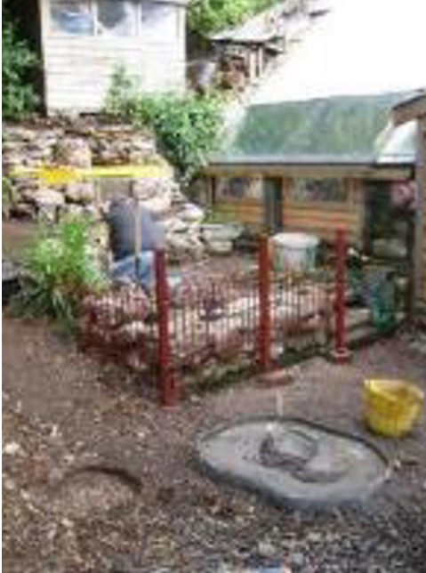
Figure 2. Construction of a small pond from recycled components