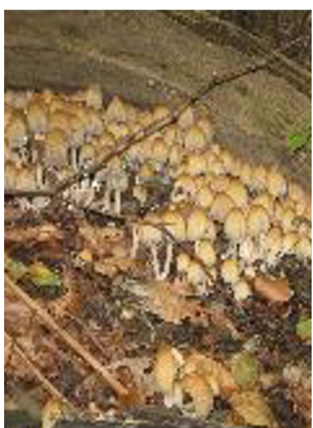
Figure 11. Mushrooms