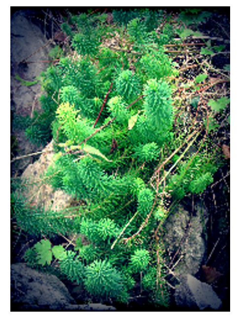
Figure 12. Belongs to the ocean?