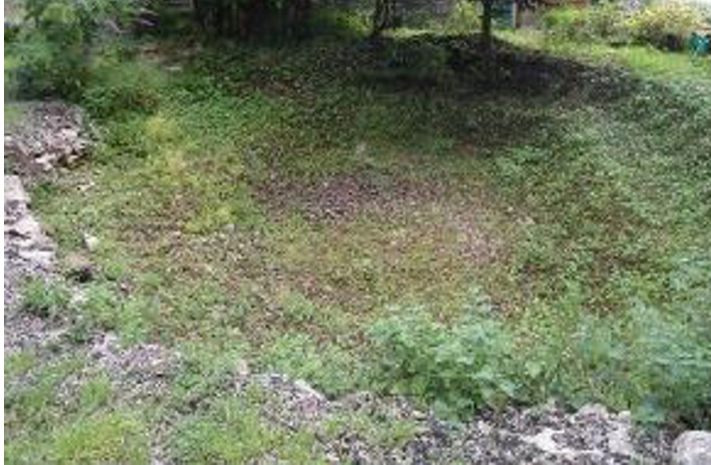
Figure 3 & 4. Dry stone walling and wildlife pond development