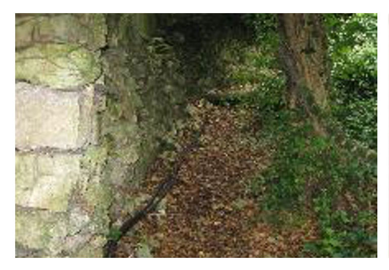
Figure 13. Woodland path

"This place is starting to make a bit of sense now. At first the quirkiness that is so apparent on first arriving, characterised by these follies dotted around like the old cart and fairground ride artefact, it just seemed to be totally random. And it is of course,