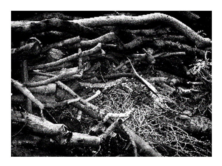
Figure 6.

"There's a real sense of renewal here in respect of the activities and achievements the volunteers are engaged with. Renewal in a physical sense in respect