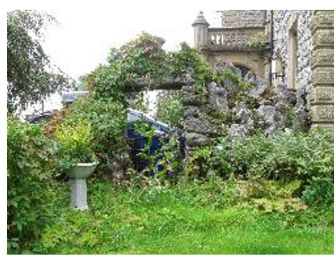
Figure 8.

George highlighted enhanced social capital as a highly