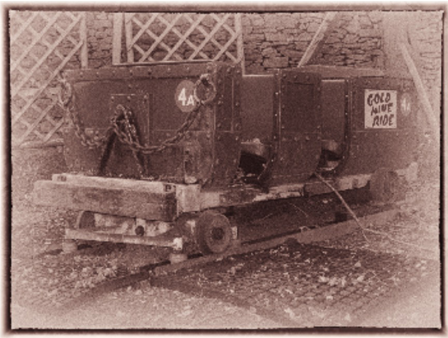
Figure 14. 'Gold Mine Ride'