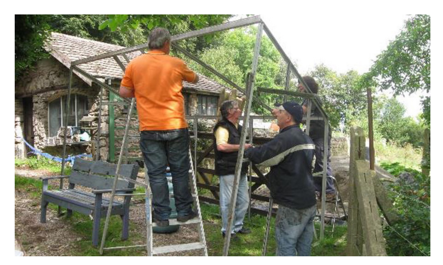
Figure 9. Constructing a greenhouse