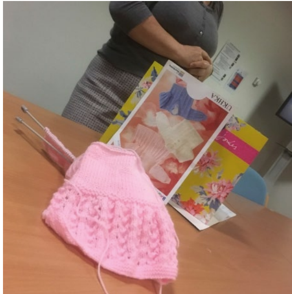
Senior Charge Nurse:

Life is a cardigan in progress, it needs a pattern, process and be a little soft and woolly ... Group coaching made me think differently about asking questions and being questioned ... I don't have to do it all myself ... I am more controlling than I thought, and I need to be able to hand over control ... I found the stories from the army thought provoking.