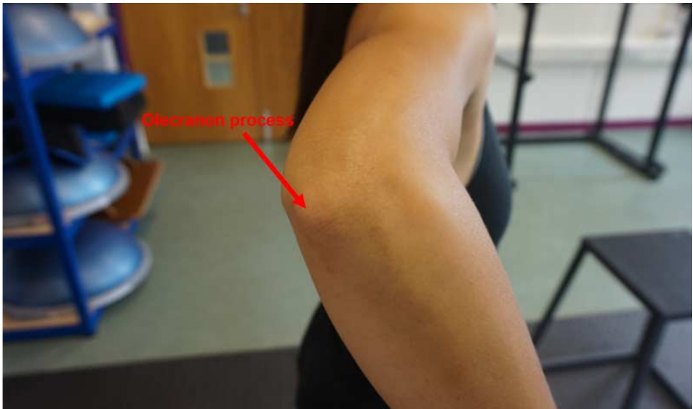
Figure 1. Coaches need to be able to palpate the apex of the olecranon process.

An important consideration for collecting reliable data is being able to locate anatomical landmarks for measuring segment alignment. For two of the tests shown in this article, coaches will need to be able to palpate the olecranon process of the ulnar (figure 1).