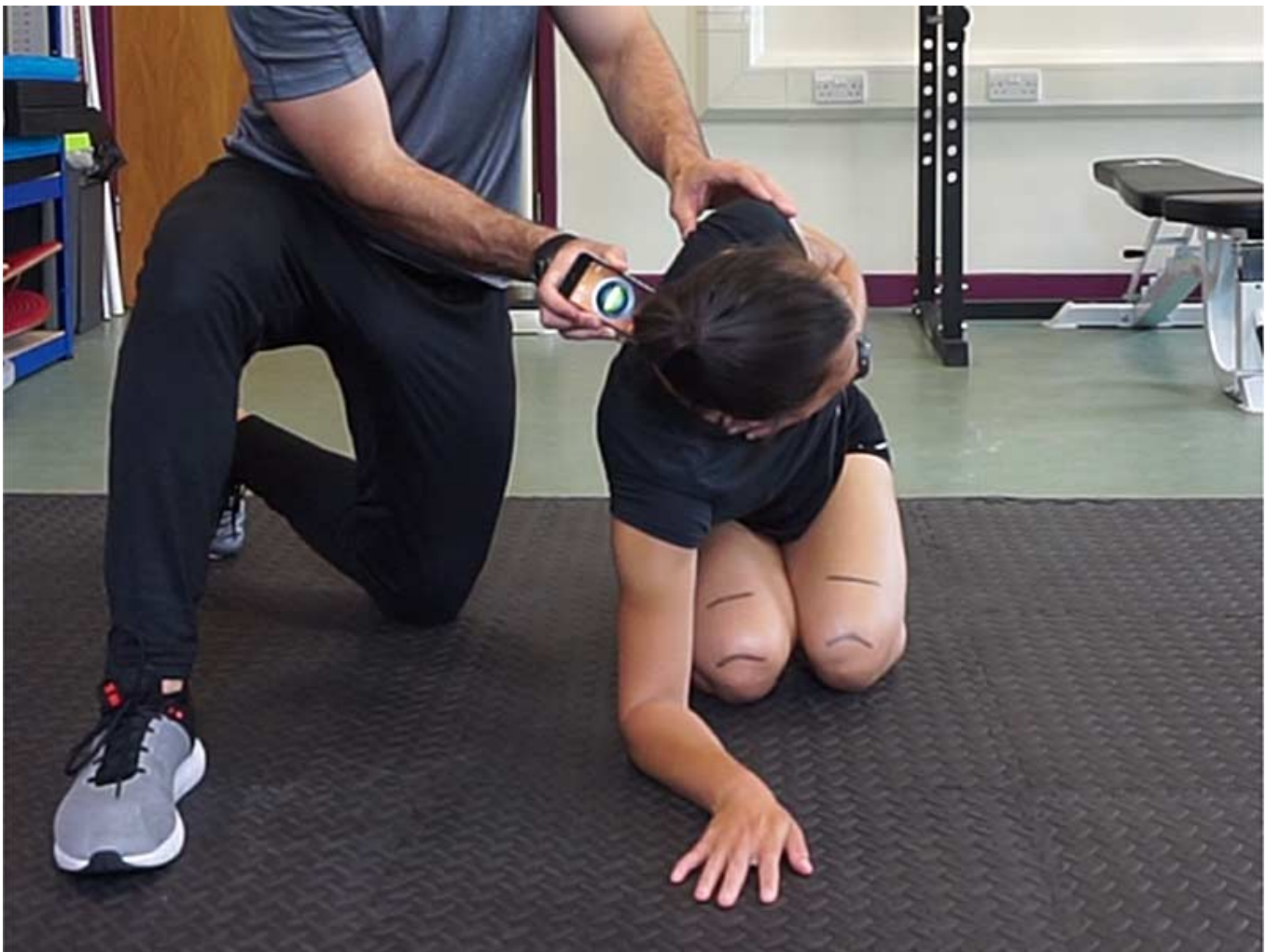
Figure 3. Demonstration of smartphone placement during the Lumbar Locked Rotation Test.

Measurement: Prior to testing, the smartphone should be calibrated relative to a vertical reference point. At the point of maximal rotation, the phone is placed at the cervicothoracic junction (see figure 3). Although palpating this anatomical location requires some amount of skill, it is generally located at the level of the neckline (think crew-cut T-shirt). In my experience, using this reference point allows you to collect a reliable measure of thoracic spine rotation without the need to palpate the specific spinal level.