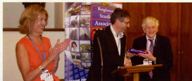
RSA President, Sir Peter Hall, is presented with a birthday present of a stick of Blackpool Rock.

The fine food and wine was enjoyed by about 100 members and there were further opportunities for catching up with friends and networking as the day was rounded off in The Red Lion public house on Whitehall.