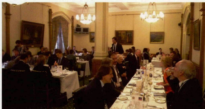
Lunch in the Churchill Room of the House of Commons