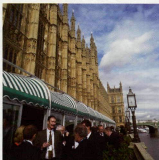
Drinks on the Terrace of the House of Commons

It was a very fitting location for the RSA annual awards ceremony (please see list of winners in the article below) presented by the President of the Association, Sir Peter Hall. He himself was also given a present in celebration of his 80th birthday. Having been