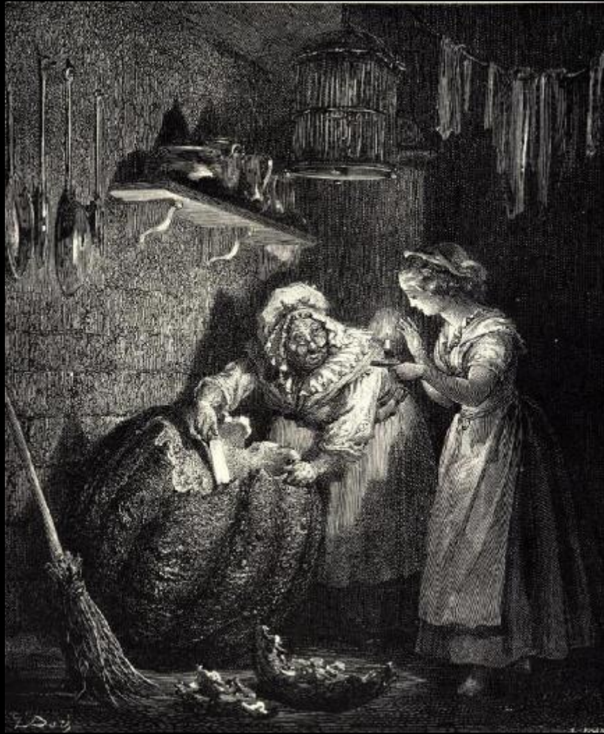
Gustave Dore Illustration for Cinderella 1867