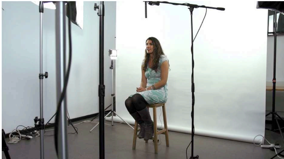
Figure 4. Young Carers Development Video