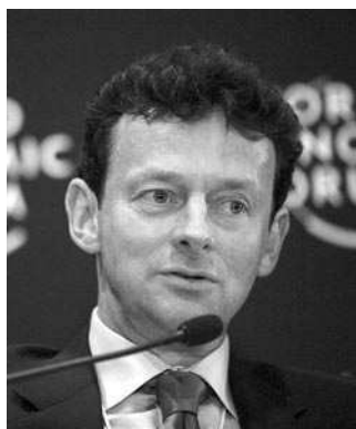
TONY HAYWARD: DID HE PARTICIPATE IN THE UNGC’S REPORT ON CEO OPINIONS ON CR AND SUSTAINABILITY?

Some limitations of the UNGC’s current approach were illustrated by (not within) the report on CEO opinions on CR and sustainability, by an international consulting firm, which set the tone for the Leaders Summit. On the one hand, it had some useful analysis of cross-cutting changes that are needed in mainstream CR, such as changes to the investment practices and regulations to internalise more externalities. 3 It is promising to see