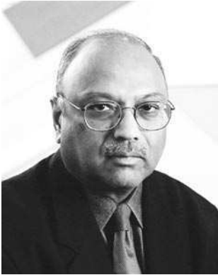
C.K. PRAHALAD: 1941–2010: PROGRESS STILL TO BE MADE AROUND HIS BoP LEGACY