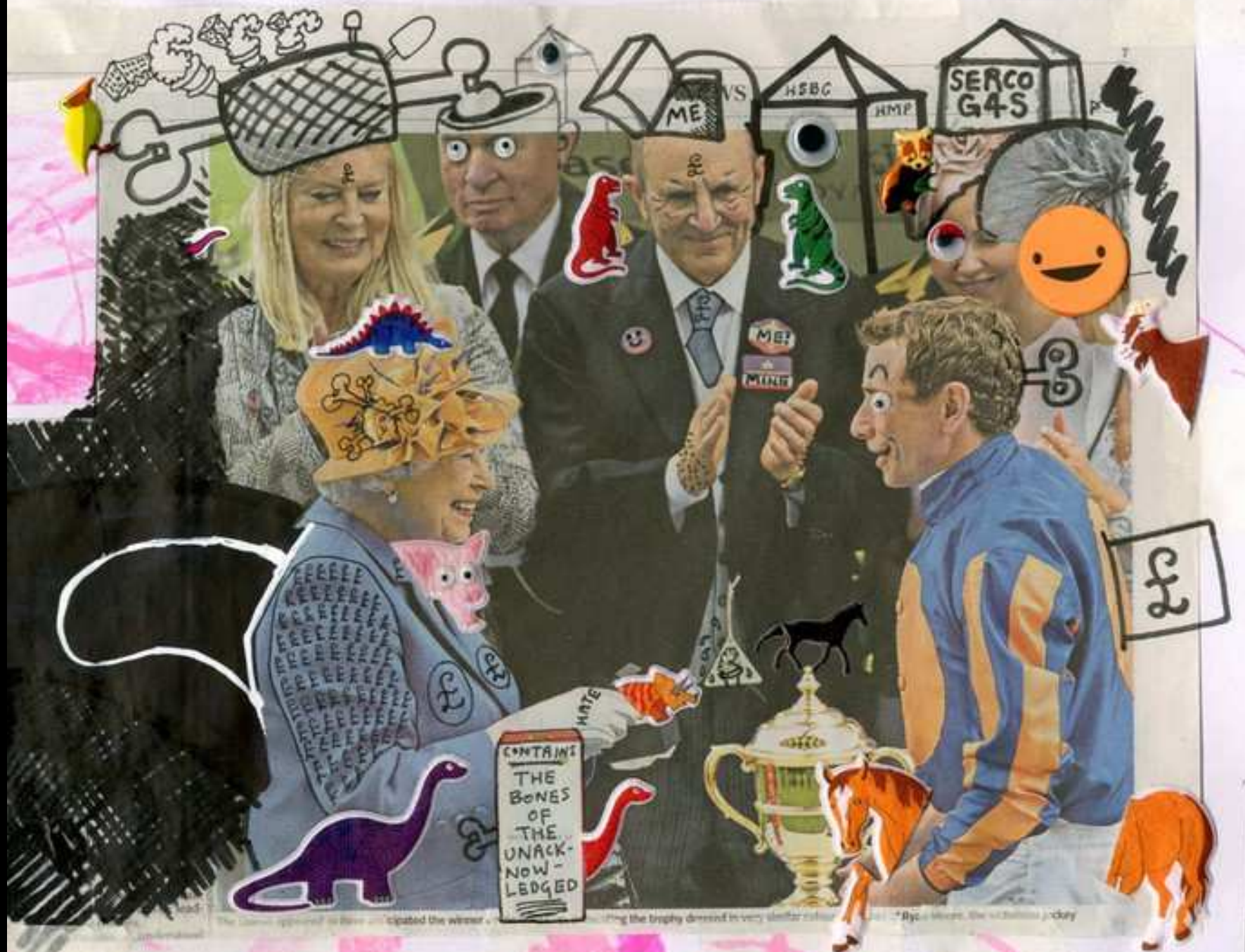
The winner appeared to have capitulated the winner... the trophy dressed in very similar colour... By the way, the victorious jockey