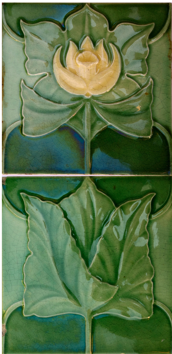
Figure 6 – “Flower and Leaf” moulded tiles, J C Edwards