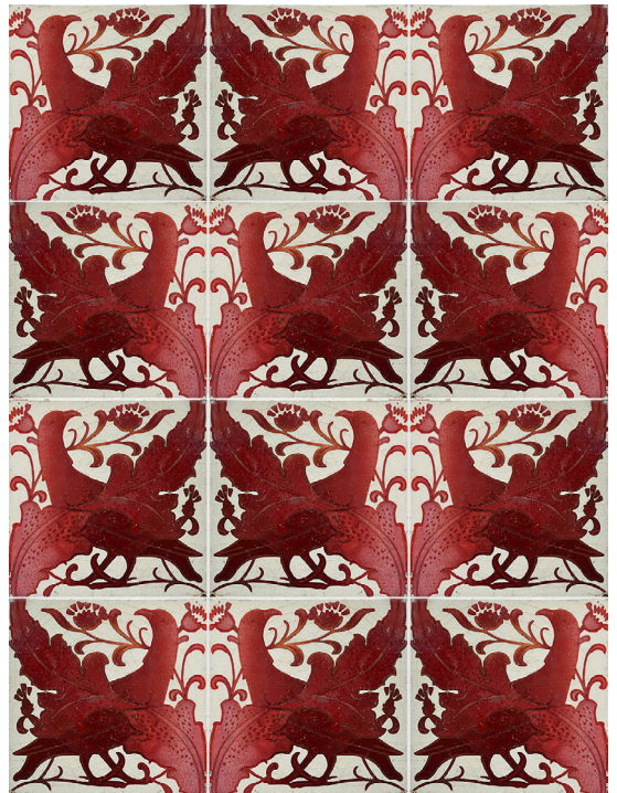
Figure 3 – “Bird” lustre tile, J C Edwards (above left)