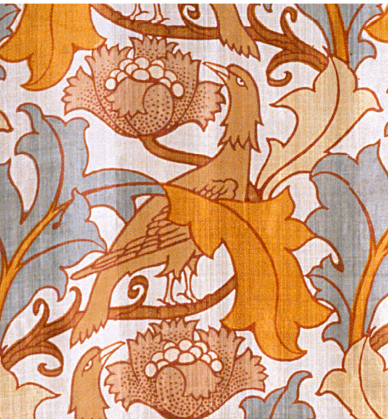
Figure 5 – “Halcyon” printed fabric (detail) c1893 LACMA (left)