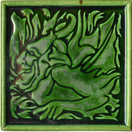
Figure 1 – “The Demon” teapot stand, J C Edwards (left)