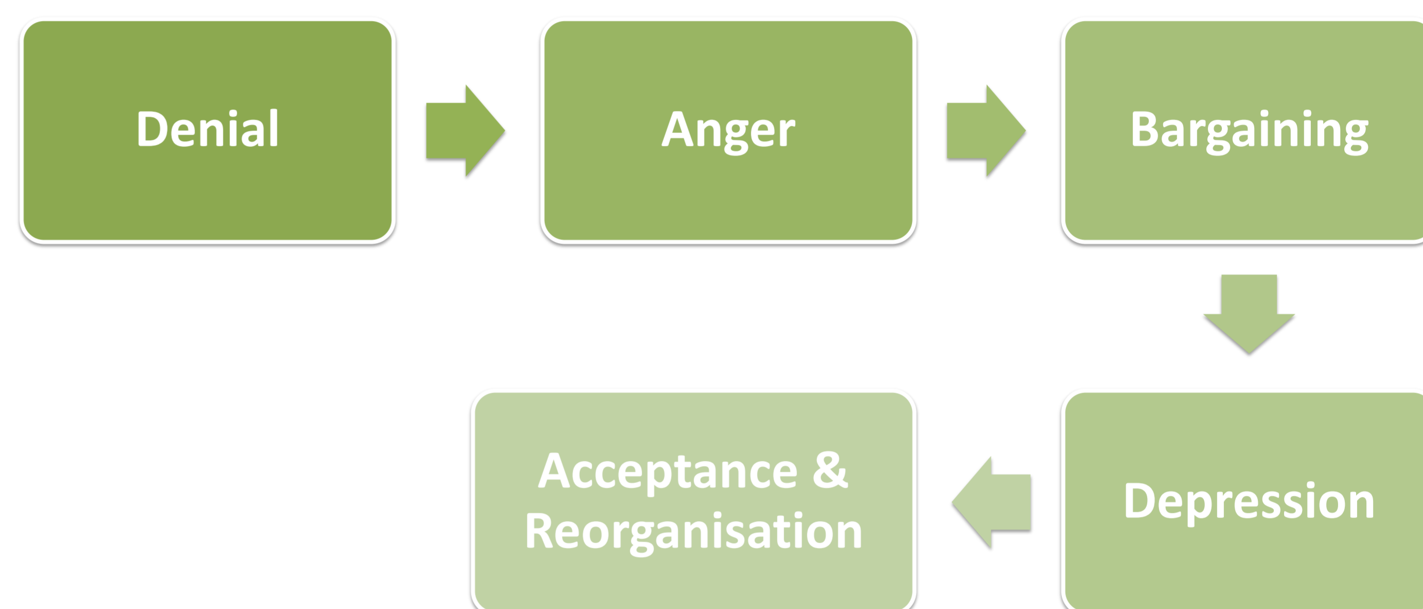
Diagram 1: Five stage grief process (Kübler-Ross, 2005)