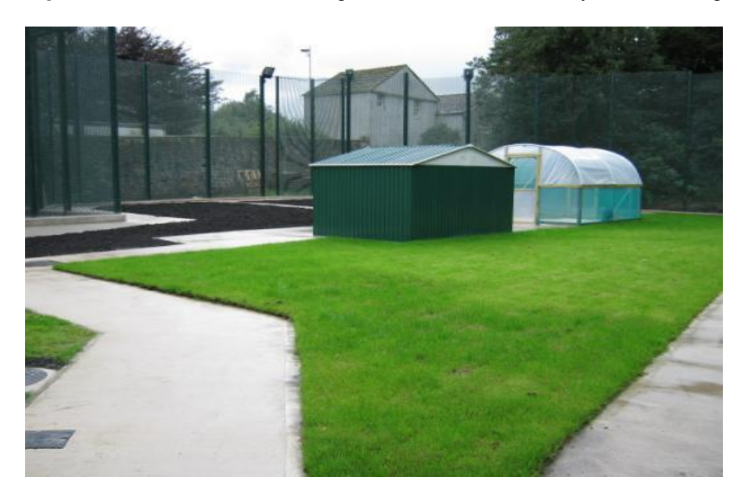
Figure 1. The medium secure unit garden involved in the study with shed & greenhouse