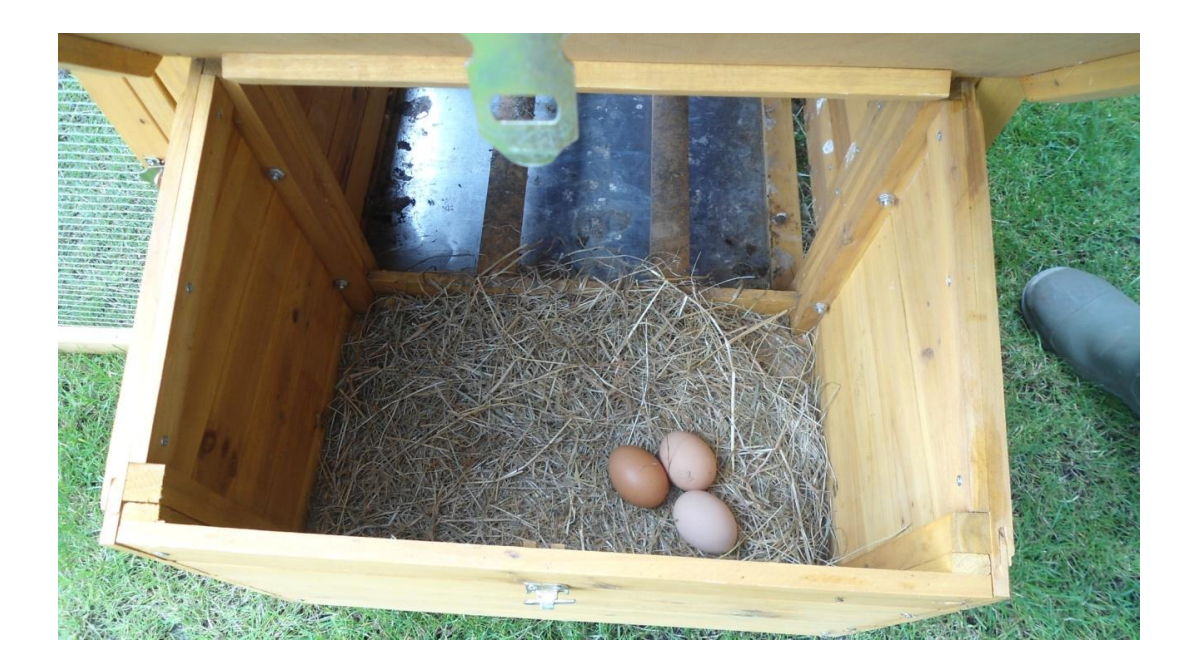
Figure 2. The chicken coup

Figure 1. The medium secure unit garden involved in the study with shed & greenhouse