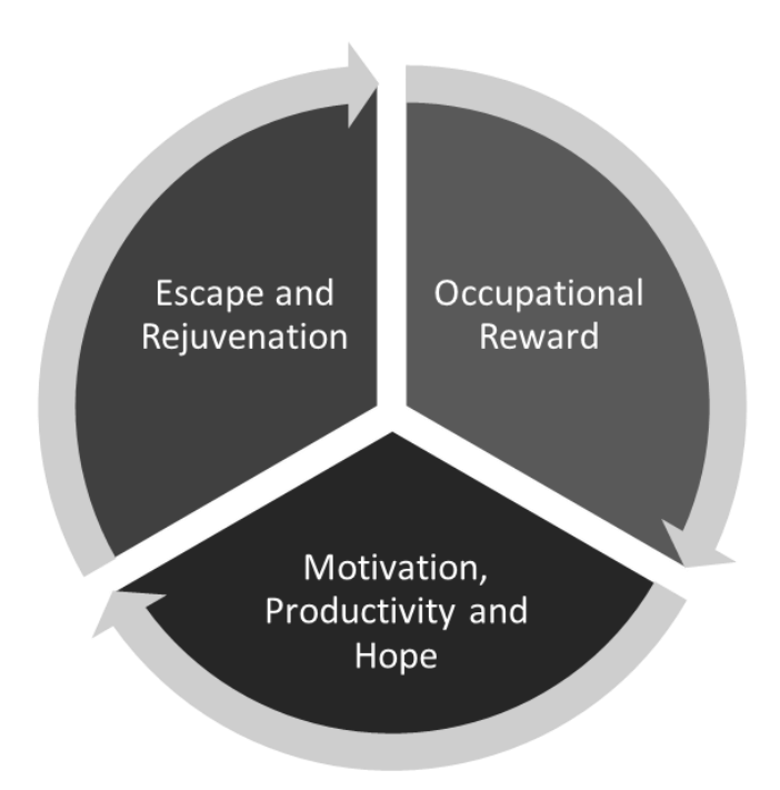
Figure 6. Emergent core themes