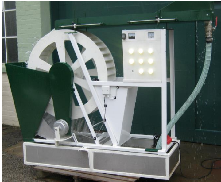
Figure 1: Prototype 1m diameter overshot waterwheel with water return by a submersible pump and connection to an LED lighting display.

The initial wheel and buckets are made from sheet metal and a submersible pump returns the water to a launder which feeds the water back onto the wheel. Electricity is generated via an induction motor to light up a low voltage LED lighting display. Initial tests on the prototype modern waterwheel have shown it is effective and can provide a platform for further redesign.