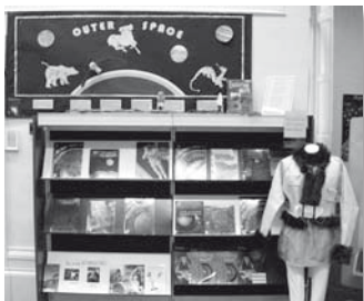
Travellers in Space